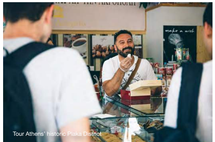
Tour Athens' historic Plaka District