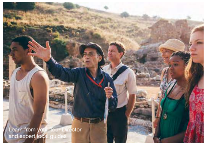
Learn from your Tour Director and expert local guides