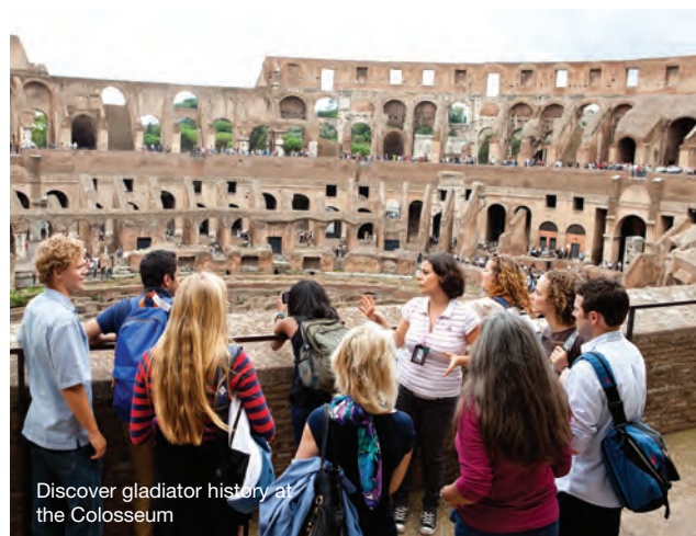
Discover gladiator history at the Colosseum