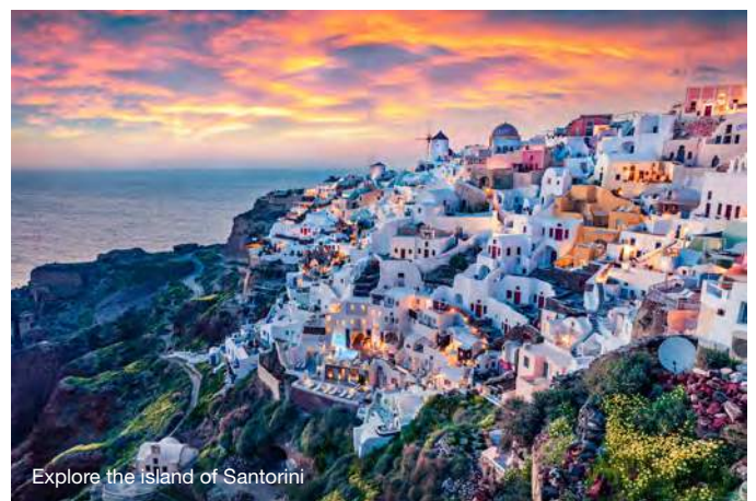
Explore the island of Santorini