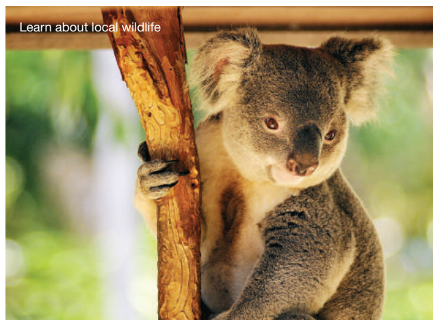
Learn about local wildlife