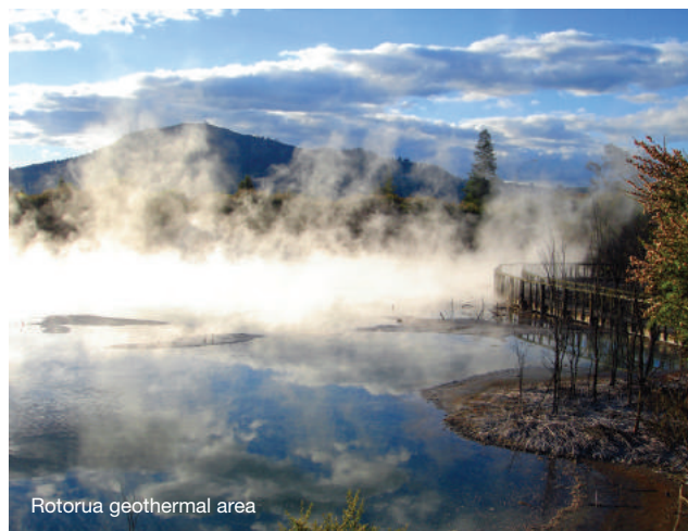
Rotorua geothermal area