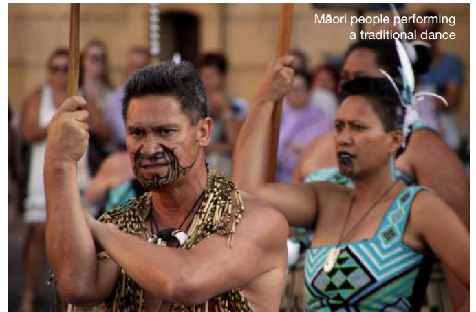
Māori people performing a traditional dance