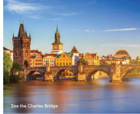
See the Charles Bridge

“I will confidently book with EF knowing that they truly have the infrastructure to handle a crisis, that they care deeply for the students, and that they remain committed to sharing the wonder of travel.”