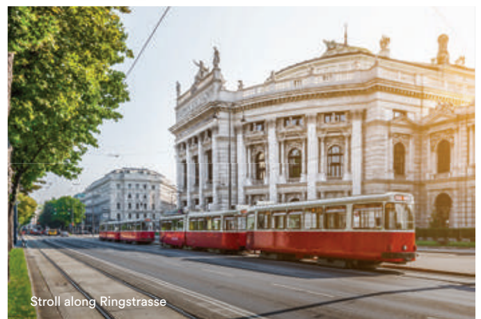
Stroll along Ringstrasse