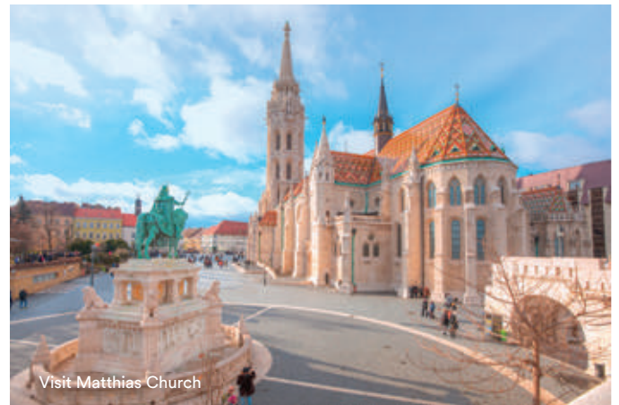
Visit Matthias Church