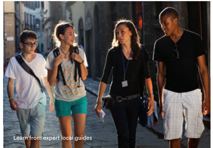
Learn from expert local guides