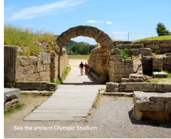
See the ancient Olympic Stadium

“I will confidently book with EF knowing that they truly have the infrastructure to handle a crisis, that they care deeply for the students, and that they remain committed to sharing the wonder of travel.”