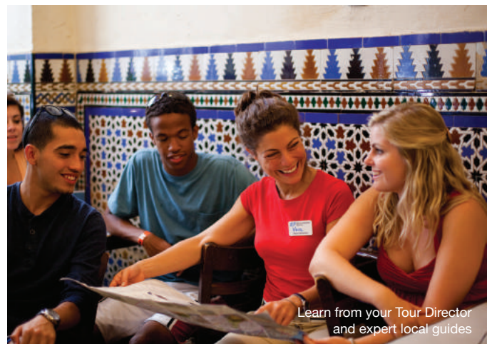
Learn from your Tour Director and expert local guides