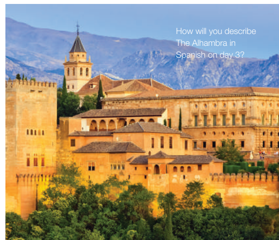
How will you describe The Alhambra in Spanish on day 3?

Your tour may be coming to an end, but your lifelong love of the Spanish language is only beginning.