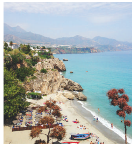
^ Spain has almost 5,000 km of coastline and some of the world's best beaches