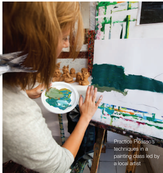
Practice Picasso's techniques in a painting class led by a local artist