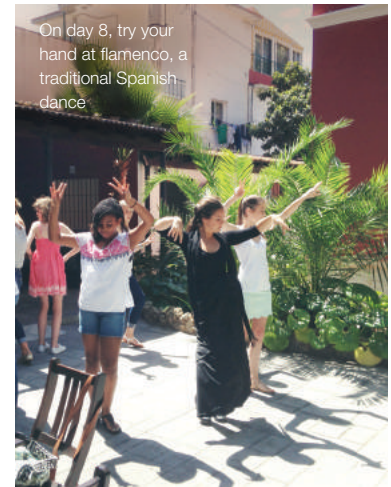
On day 8, try your hand at flamenco, a traditional Spanish dance

We believe in experiential learning at the most important sites. Your Program Director is with you at every step, providing their own perspective and local tips.