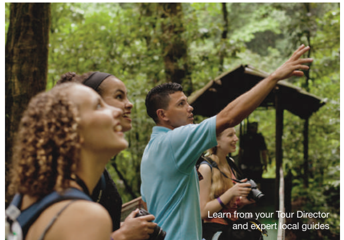
Learn from your Tour Director and expert local guides