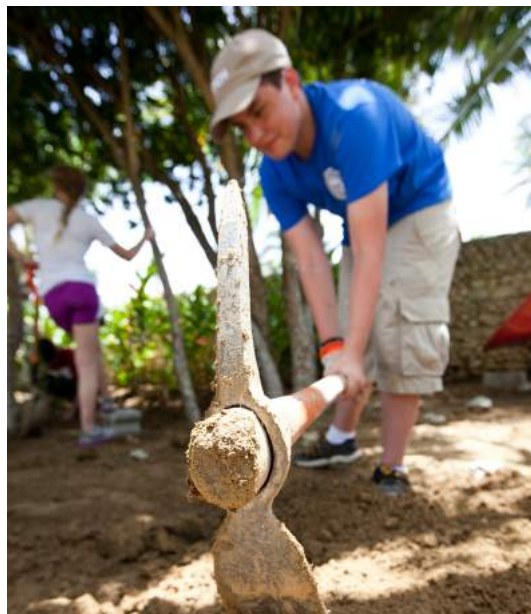
Learn how pineapples are grown and harvested at a plantation in San Francisco de Macorís.

Collaborate and learn with scientists, engineers, researchers, and other STEM practitioners in the field.