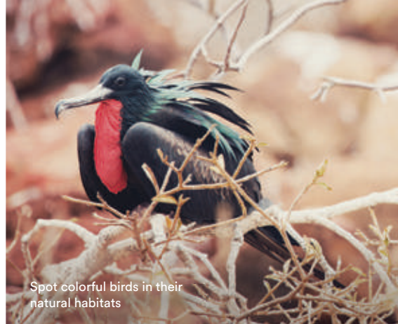
Spot colorful birds in their natural habitats

“I will confidently book with EF knowing that they truly have the infrastructure to handle a crisis, that they care deeply for the students, and that they remain committed to sharing the wonder of travel.”