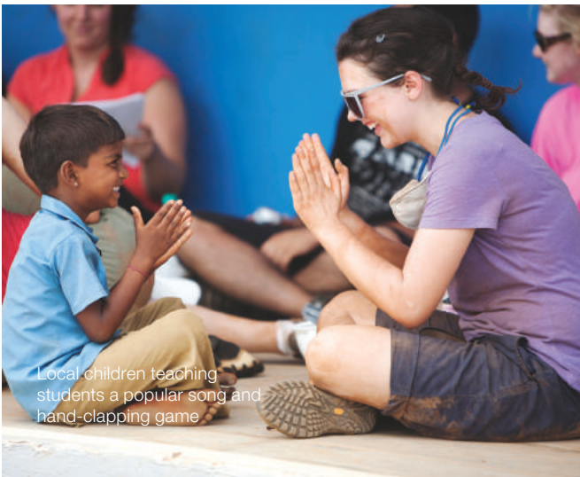
Local children teaching students a popular song and hand-clapping game