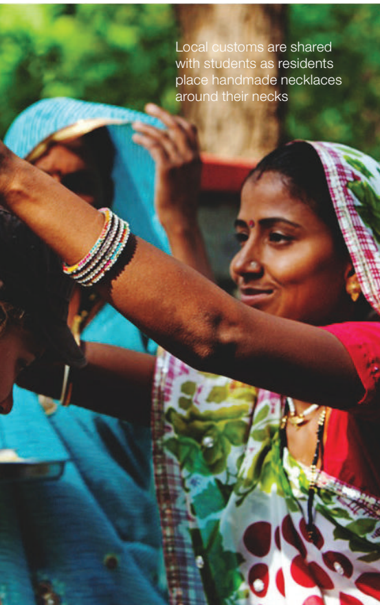
Local customs are shared with students as residents place handmade necklaces around their necks