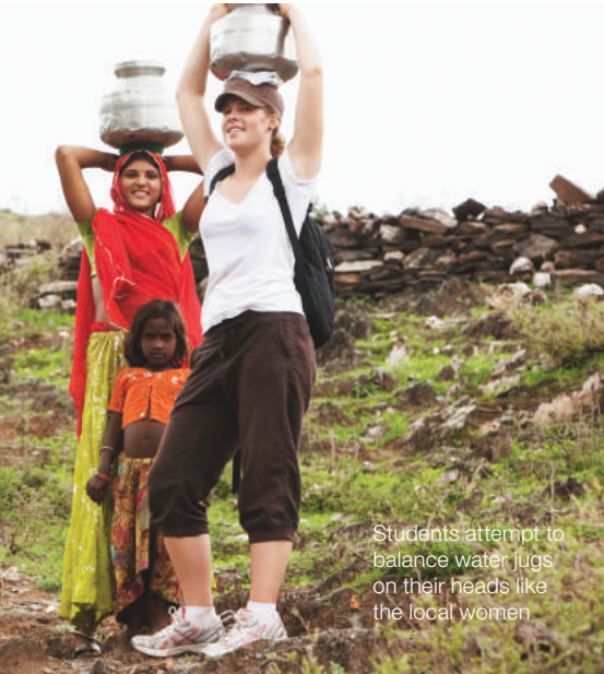
Students attempt to balance water jugs on their heads like the local women