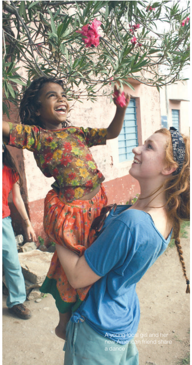
A young local girl and her new American friend share a dance