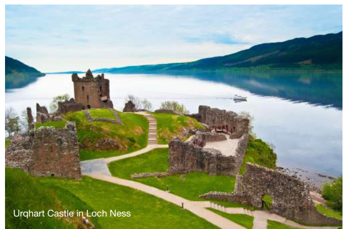
Urquhart Castle in Loch Ness