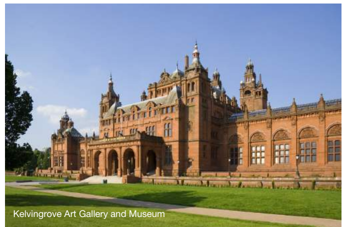
Kelvingrove Art Gallery and Museum