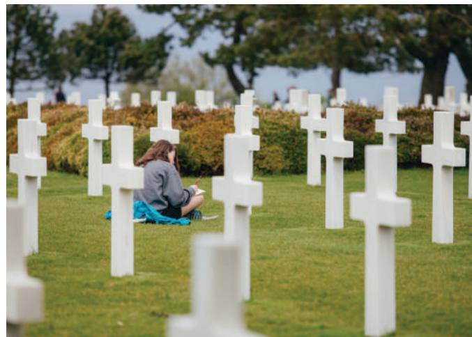
MEMORIAL & CEMETERY