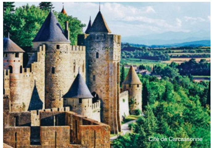
Cité de Carcassonne