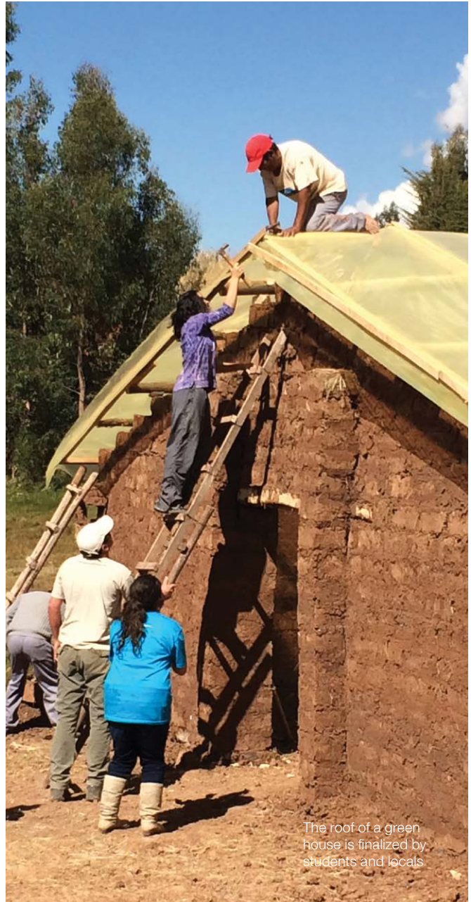
The roof of a green house is finalized by students and locals