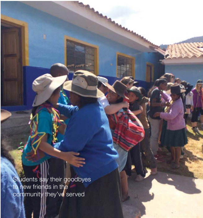
Students say their goodbyes to new friends in the community they've served