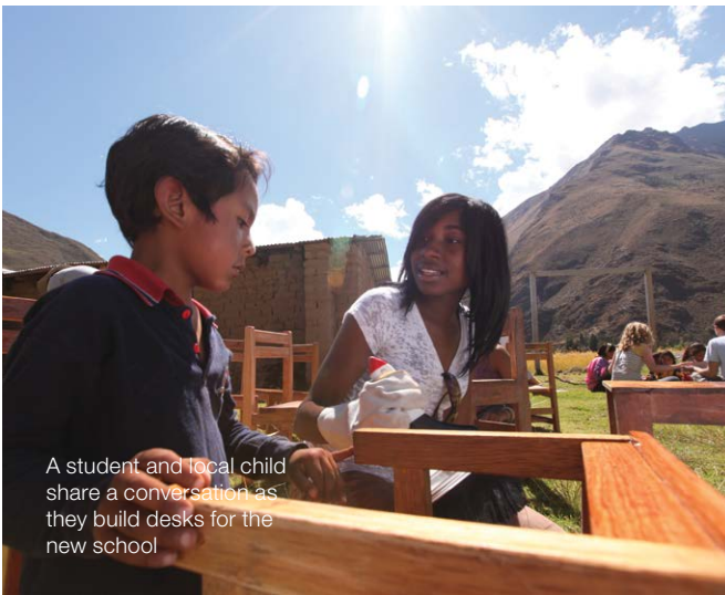
A student and local child share a conversation as they build desks for the new school