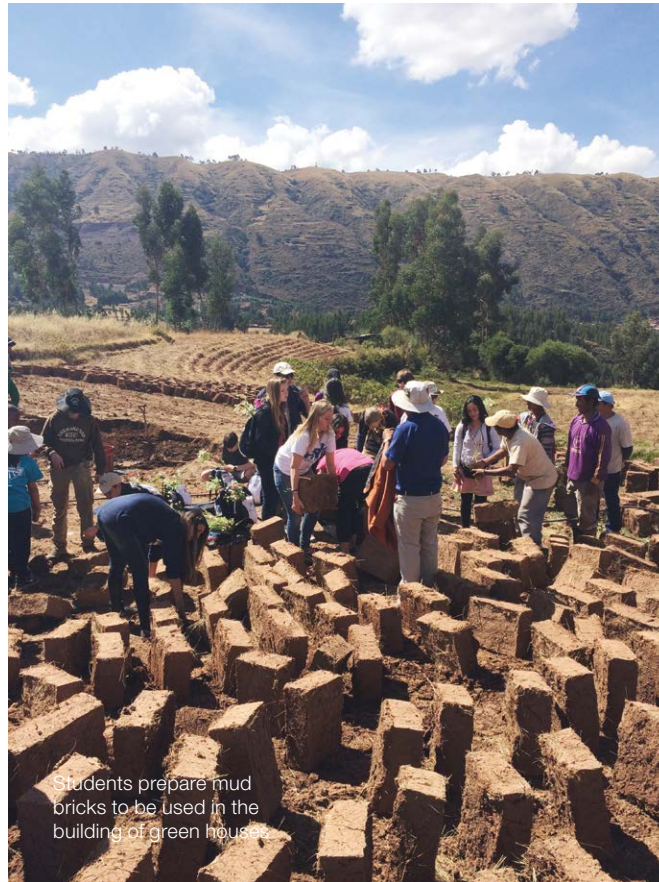
Students prepare mud bricks to be used in the building of green houses.