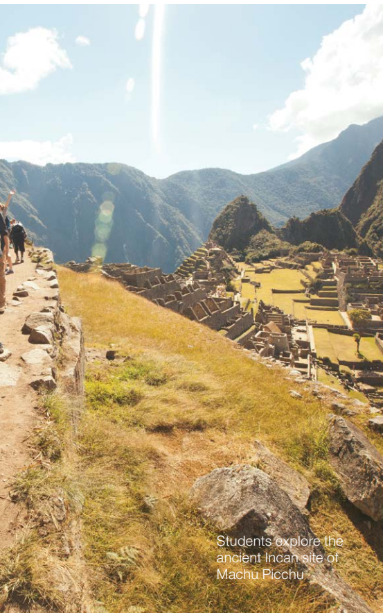
Students explore the ancient Incan site of Machu Picchu