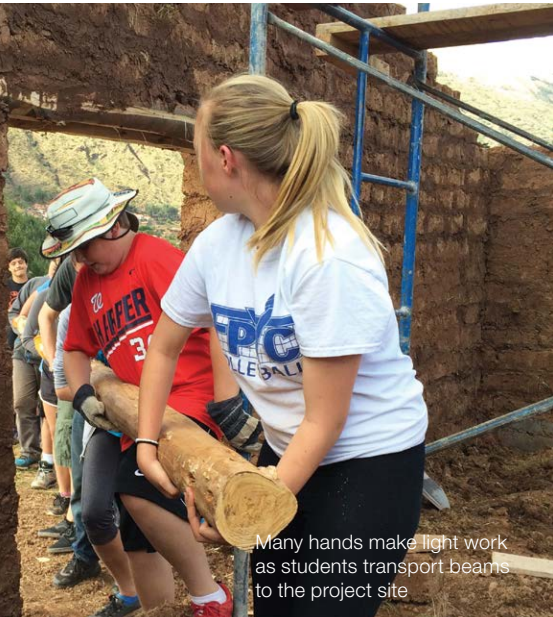
Many hands make light work as students transport beams to the project site