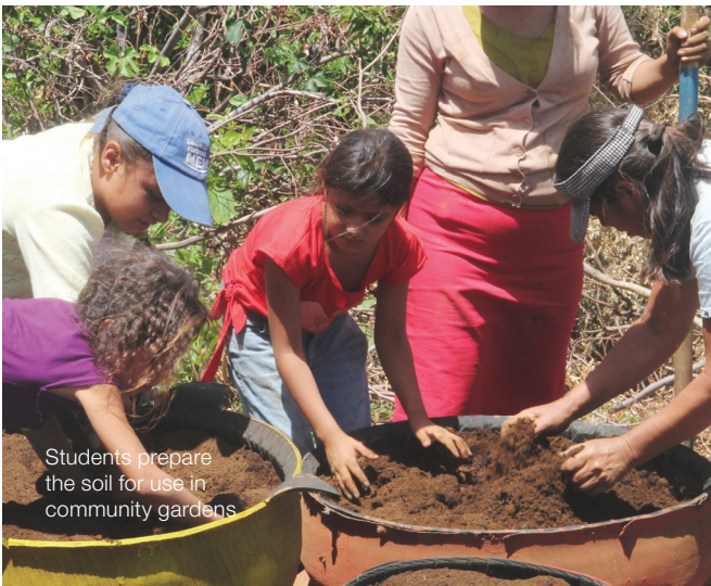
Students prepare the soil for use in community gardens