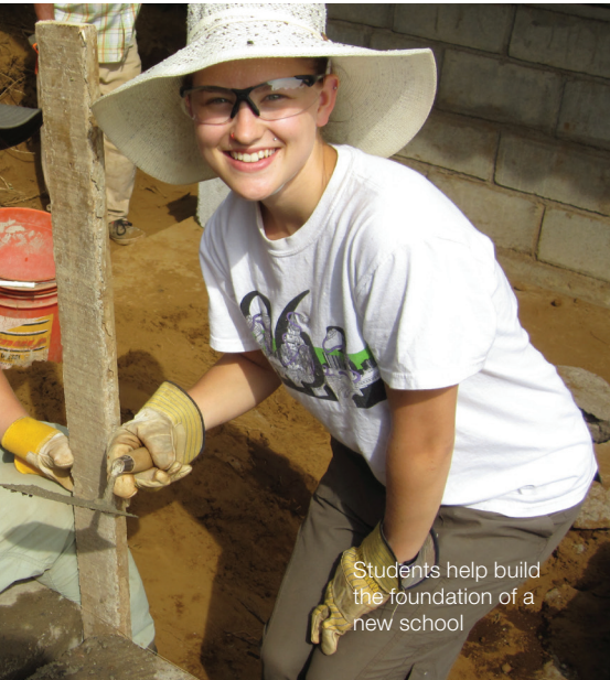
Students help build the foundation of a new school