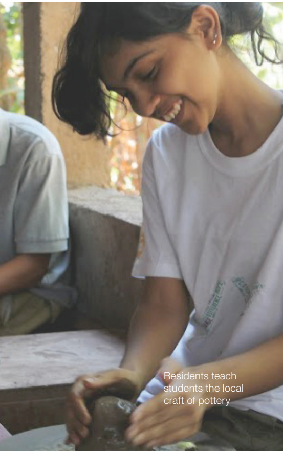
Residents teach students the local craft of pottery