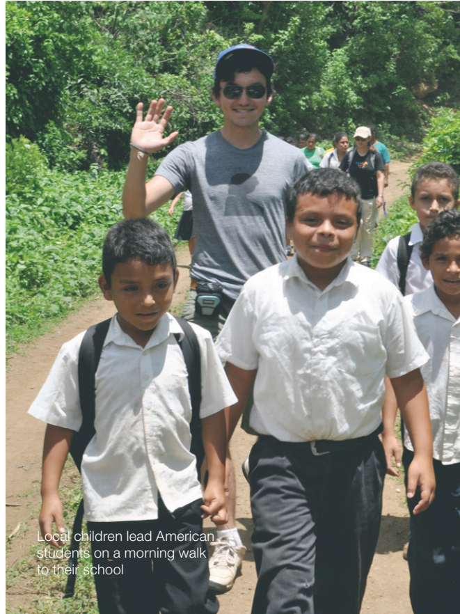
Local children lead American students on a morning walk to their school