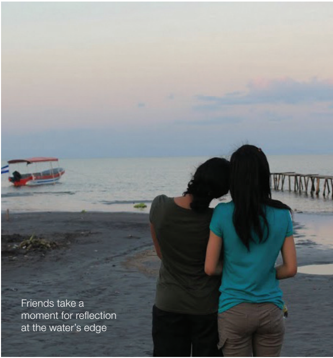
Friends take a moment for reflection at the water's edge