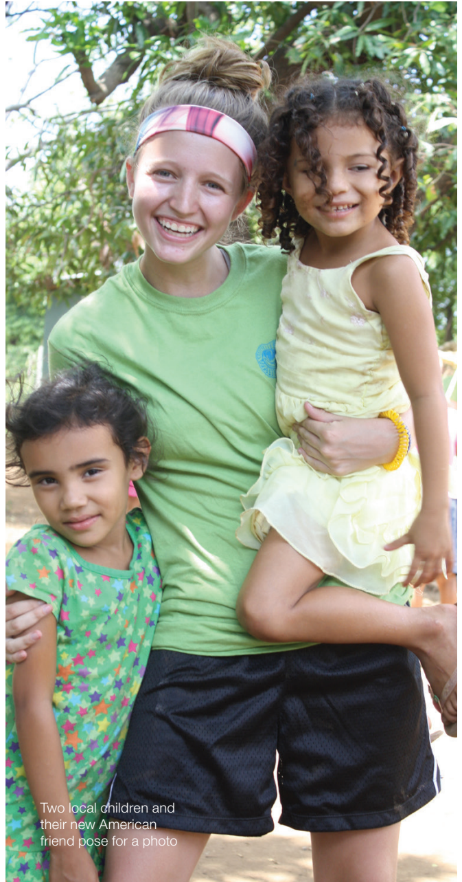
Two local children and their new American friend pose for a photo