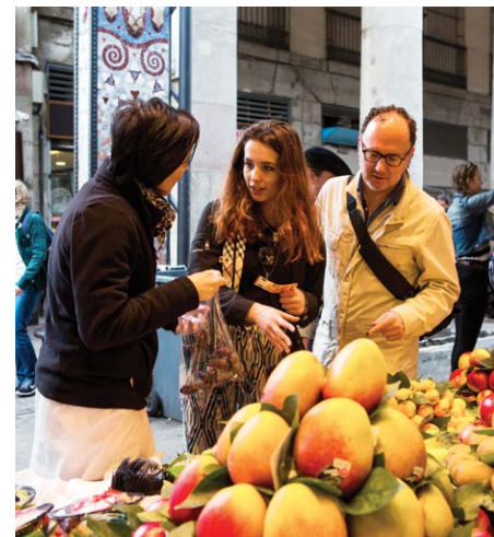
^ Interact with vendors at Madrid's produce market on day 4