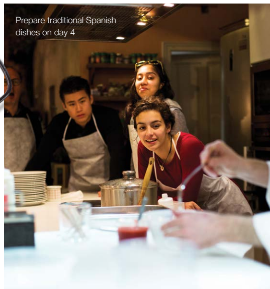
Prepare traditional Spanish dishes on day 4