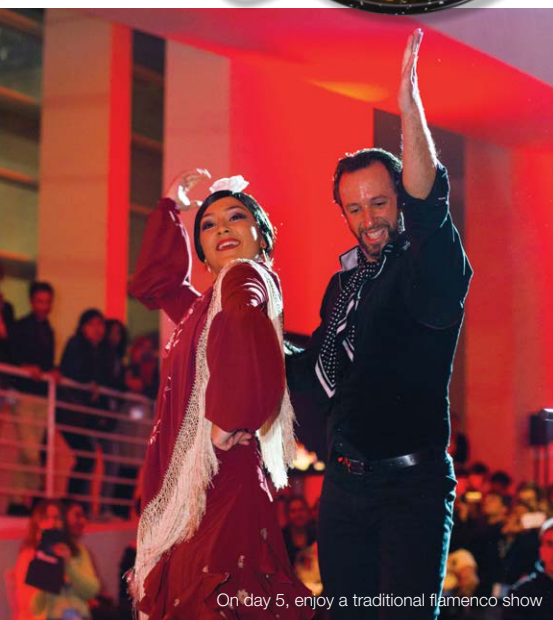
On day 5, enjoy a traditional flamenco show