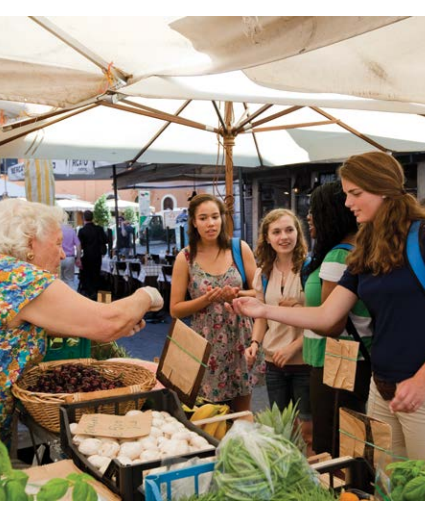
Interact with vendors at Munich's Viktualienmarkt market on day 5