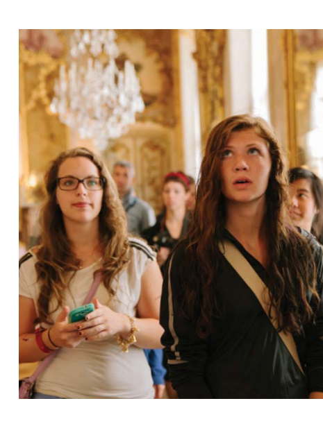
German architecture and design may leave you at a loss for words