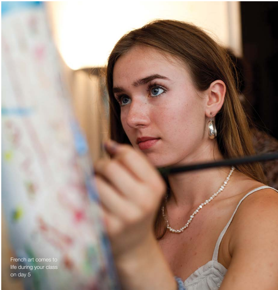
French art comes to life during your class on day 5