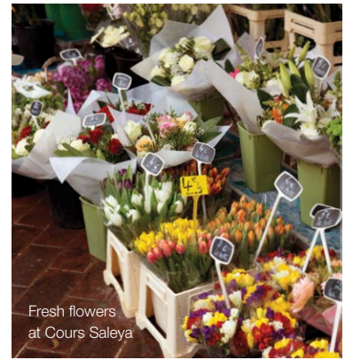
Fresh flowers at Cours Saleya

We believe in experiential learning at the most important sites. Your Program Director is with you at every step, providing their own perspective and local tips.