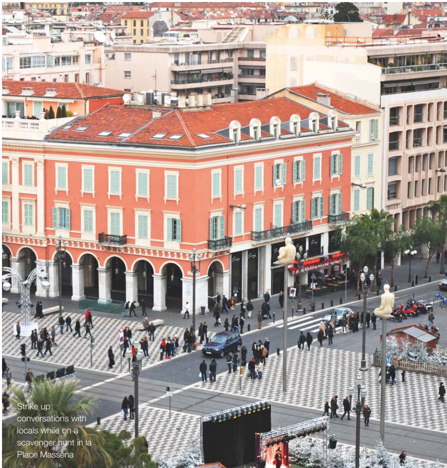
Strike up conversations with locals while on a scavenger hunt in la Place Masséna