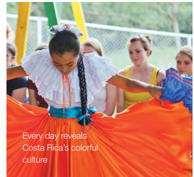
Every day reveals Costa Rica's colorful culture

We believe in experiential learning at the most important sites. Your Program Director is with you at every step, providing their own perspective and local tips.