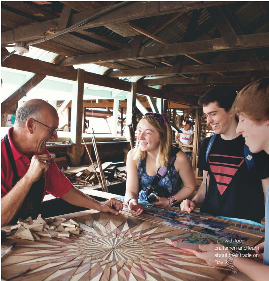
Talk with local craftsmen and learn about their trade on Day 2