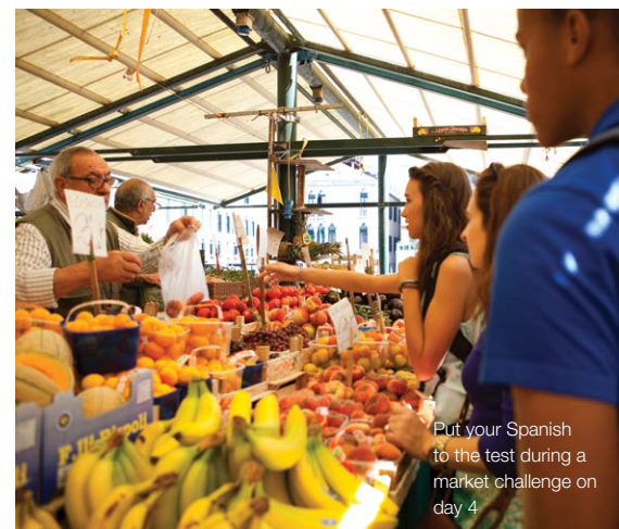
Put your Spanish to the test during a market challenge on day 4.