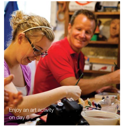
Enjoy an art activity on day 6

We believe in experiential learning at the most important sites. Your Program Director is with you at every step, providing their own perspective and local tips.