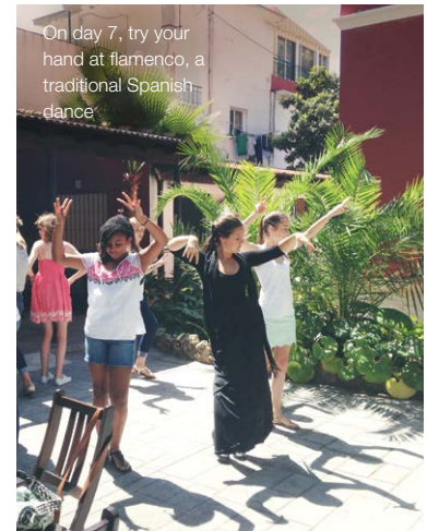
On day 7, try your hand at flamenco, a traditional Spanish dance.

We believe in experiential learning at the most important sites. Your Program Director is with you at every step, providing their own perspective and local tips.