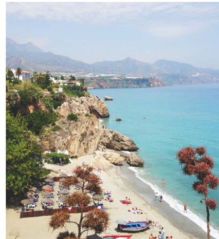
^ Spain has almost 5,000 km of coastline and some of the world's best beaches