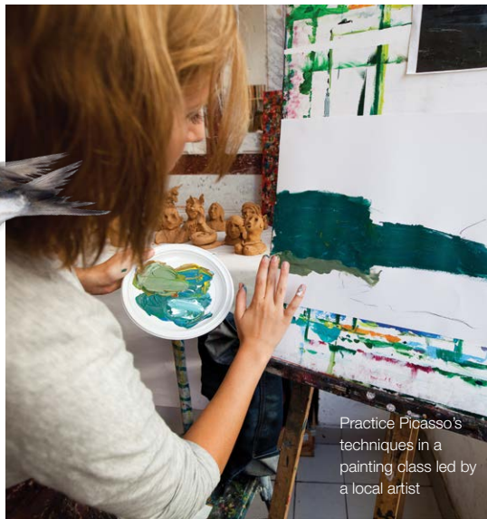
Practice Picasso's techniques in a painting class led by a local artist