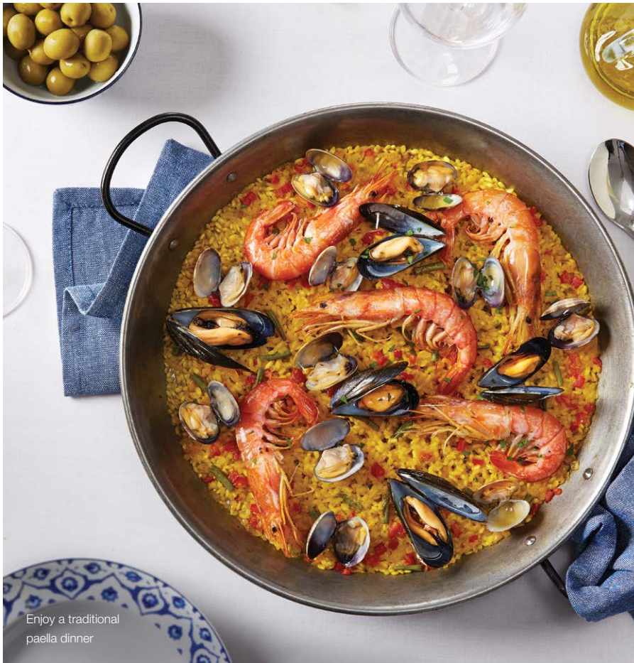
Enjoy a traditional paella dinner