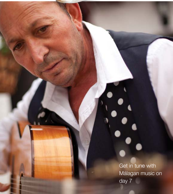
Get in tune with Málaga's music on day 7