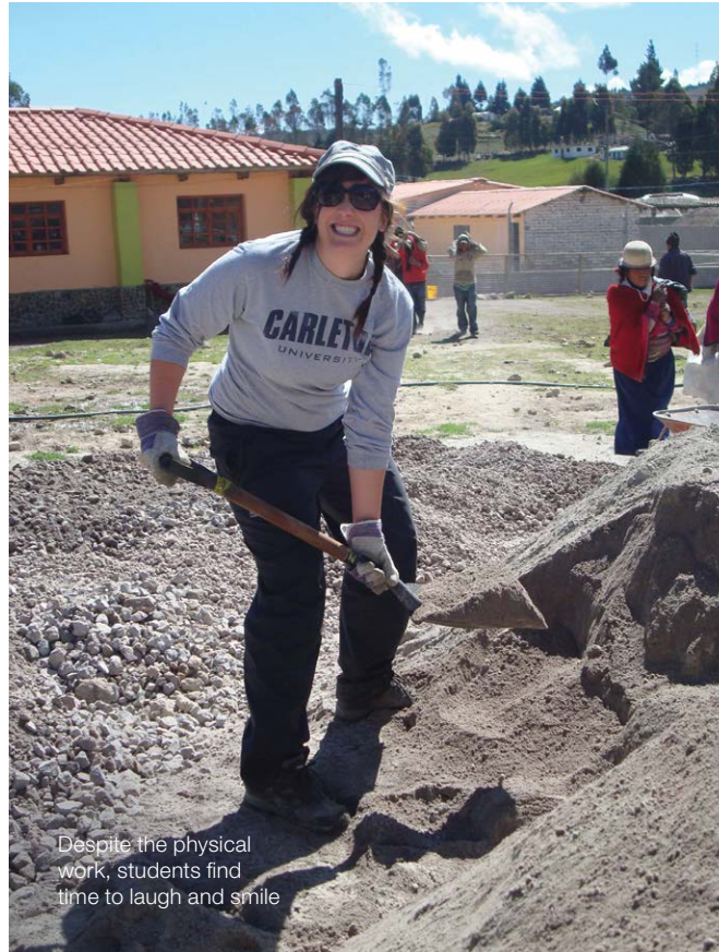
Despite the physical work, students find time to laugh and smile