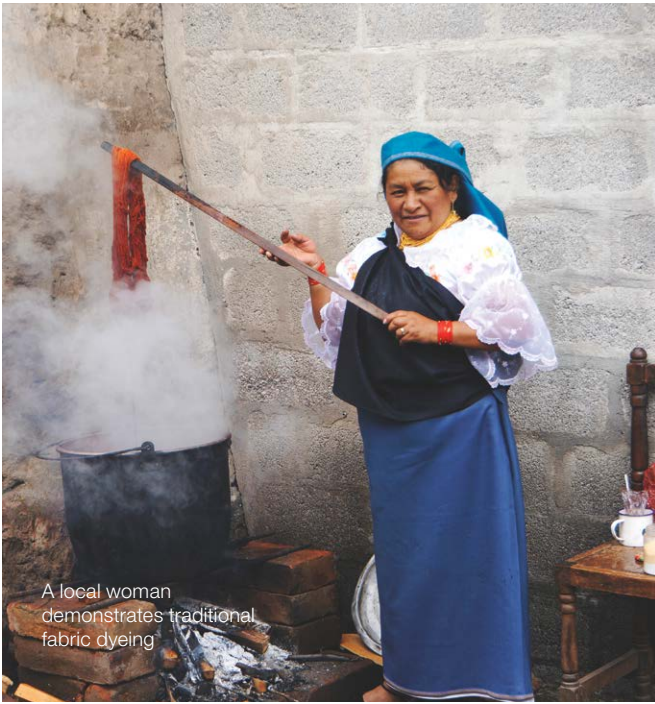
A local woman demonstrates traditional fabric dyeing