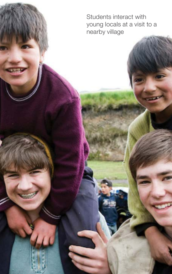
Students interact with young locals at a visit to a nearby village