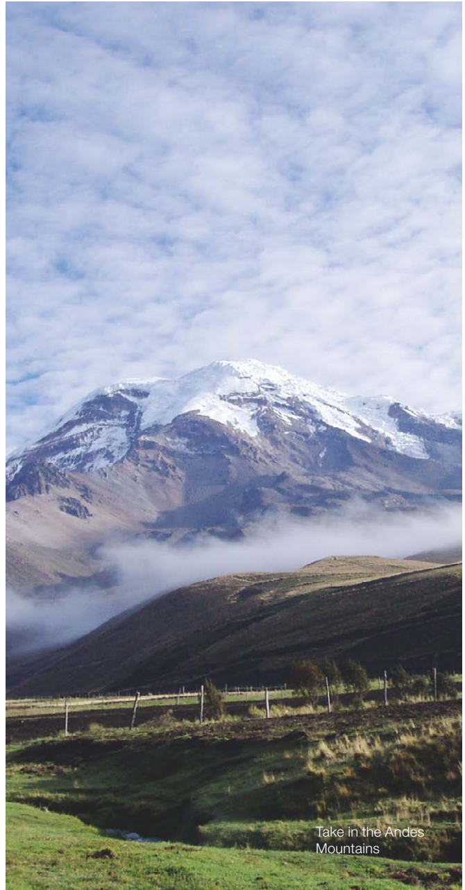
Take in the Andes Mountains