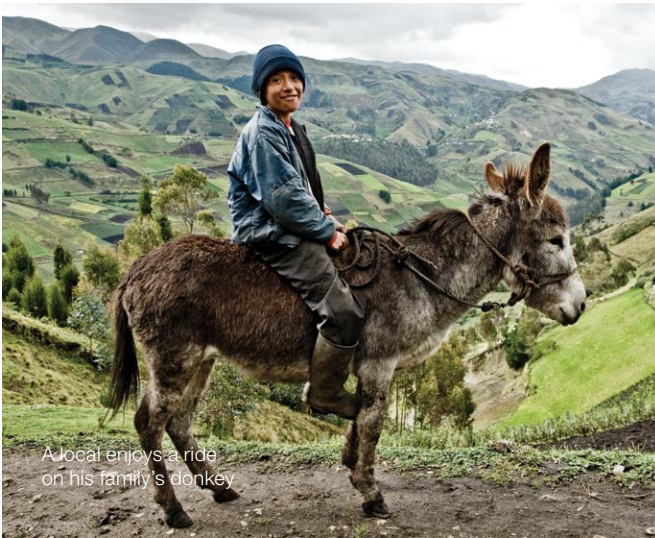
A local enjoys a ride on his family's donkey