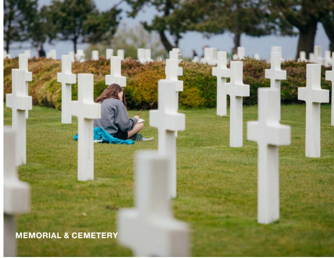
MEMORIAL & CEMETERY

Your Tour Director will help facilitate meaningful individual and group reflection through activities designed to engage travelers. Every itinerary is customizable to create a personalized and profound experience for your group.