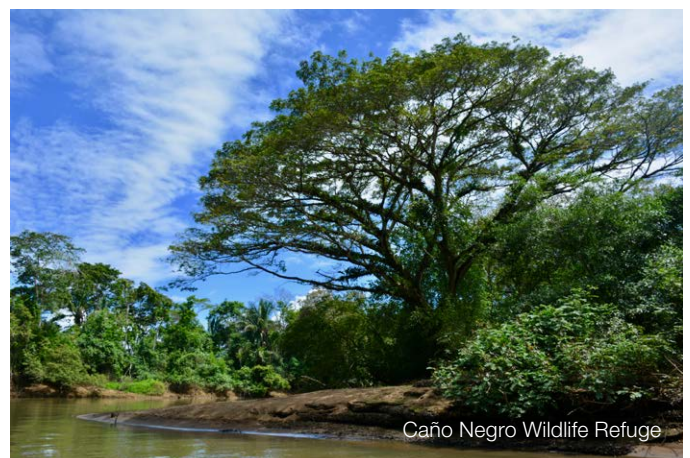
Caño Negro Wildlife Refuge