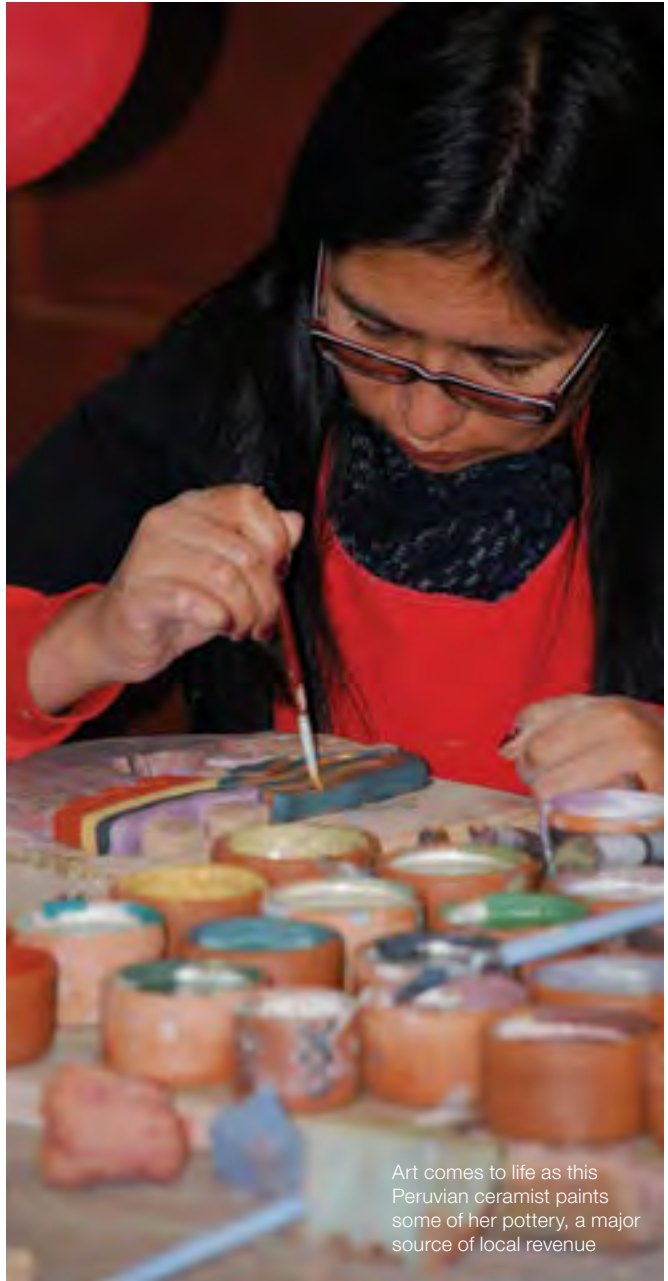
Art comes to life as this Peruvian ceramist paints some of her pottery, a major source of local revenue