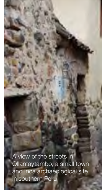
A view of the streets in Ollantaytambo, a small town and Inca archaeological site in southern Peru