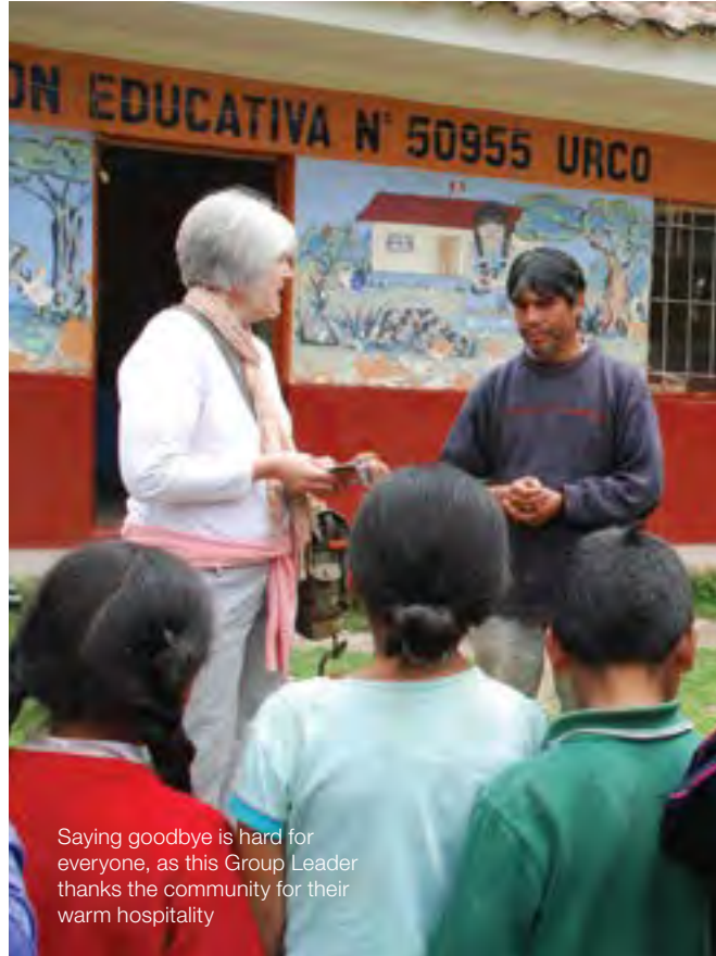
Saying goodbye is hard for everyone, as this Group Leader thanks the community for their warm hospitality