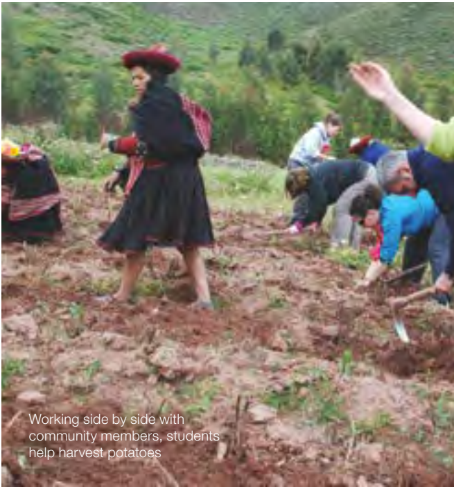
Working side by side with community members, students help harvest potatoes