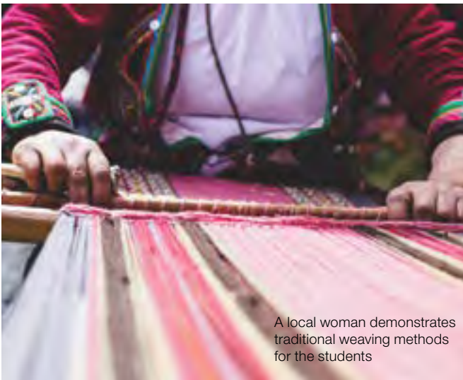
A local woman demonstrates traditional weaving methods for the students