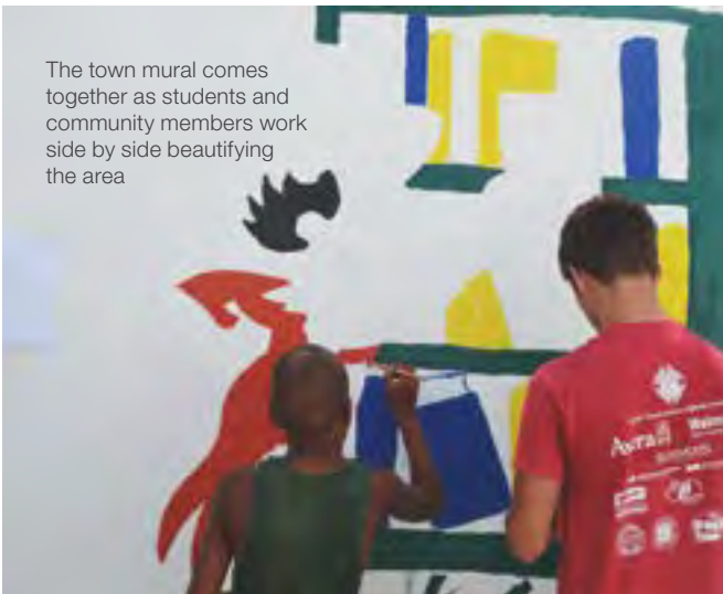
The town mural comes together as students and community members work side by side beautifying the area