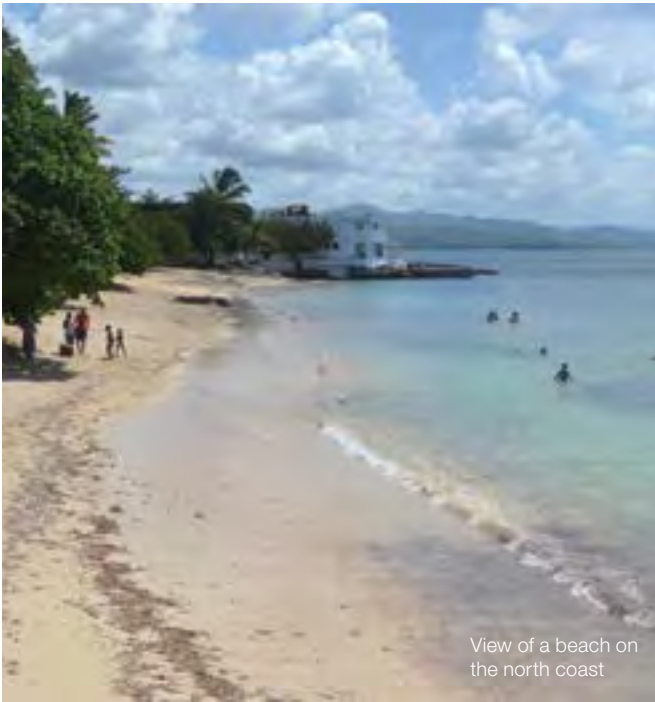
View of a beach on the north coast