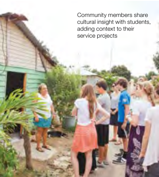
Community members share cultural insight with students, adding context to their service projects