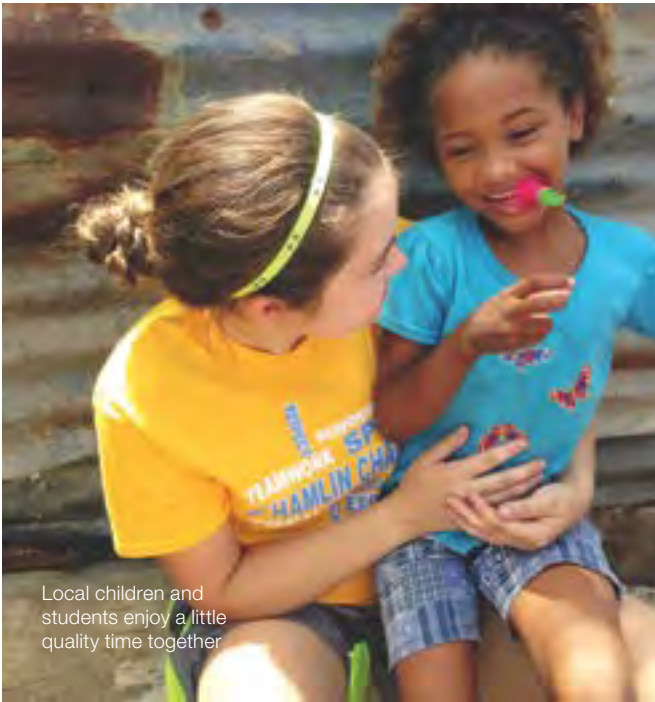
Local children and students enjoy a little quality time together