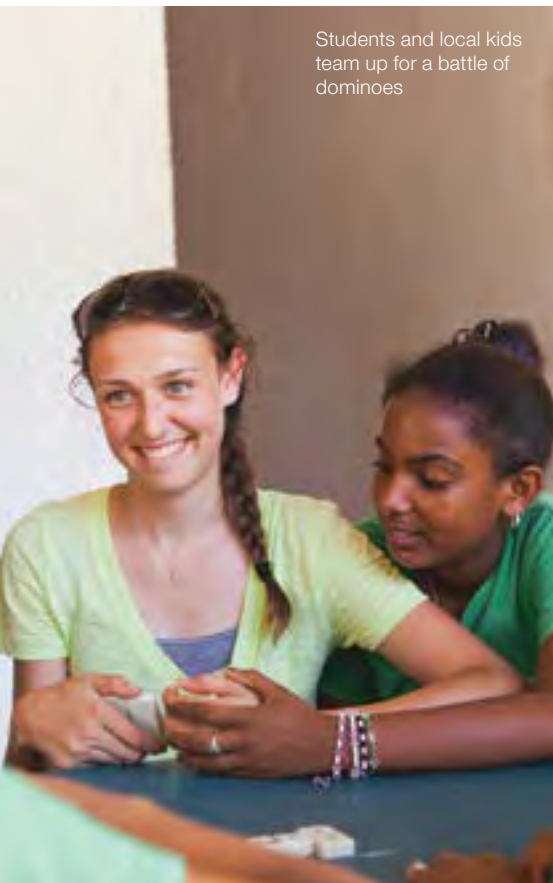
Students and local kids team up for a battle of dominoes