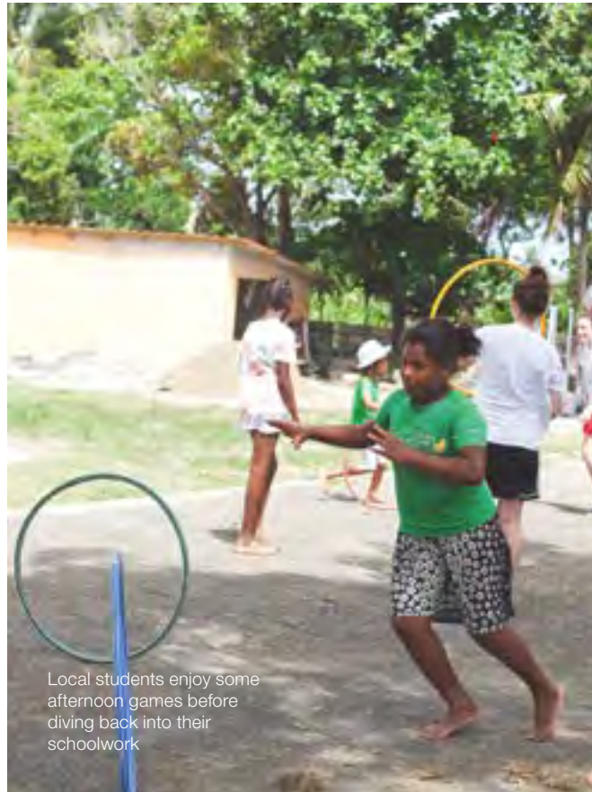
Local students enjoy some afternoon games before diving back into their schoolwork