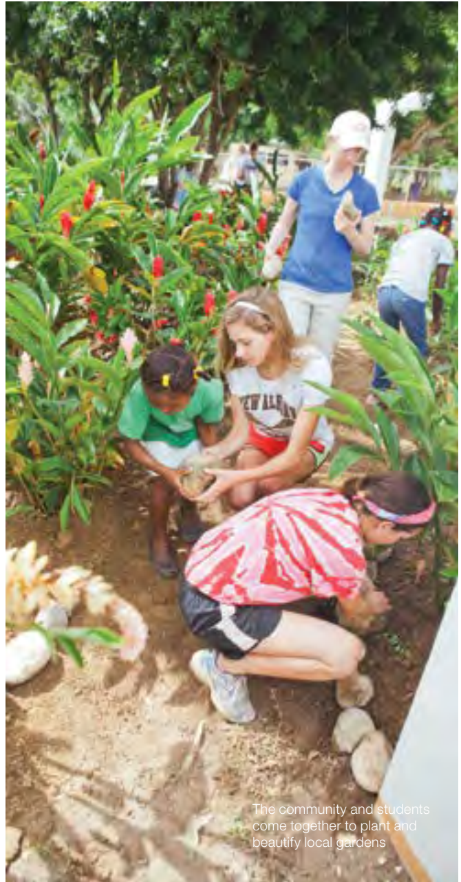
The community and students come together to plant and beautify local gardens