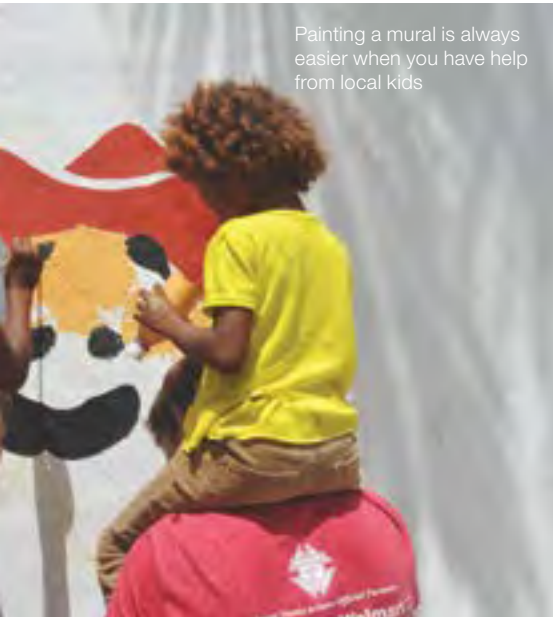
Painting a mural is always easier when you have help from local kids