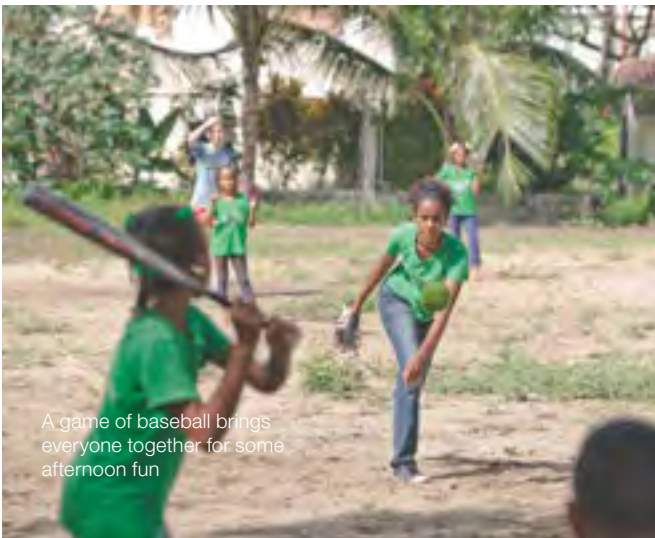
A game of baseball brings everyone together for some afternoon fun