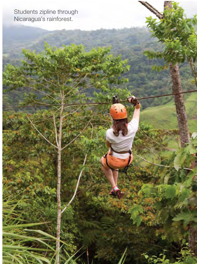
Students zipline through Nicaragua's rainforest.