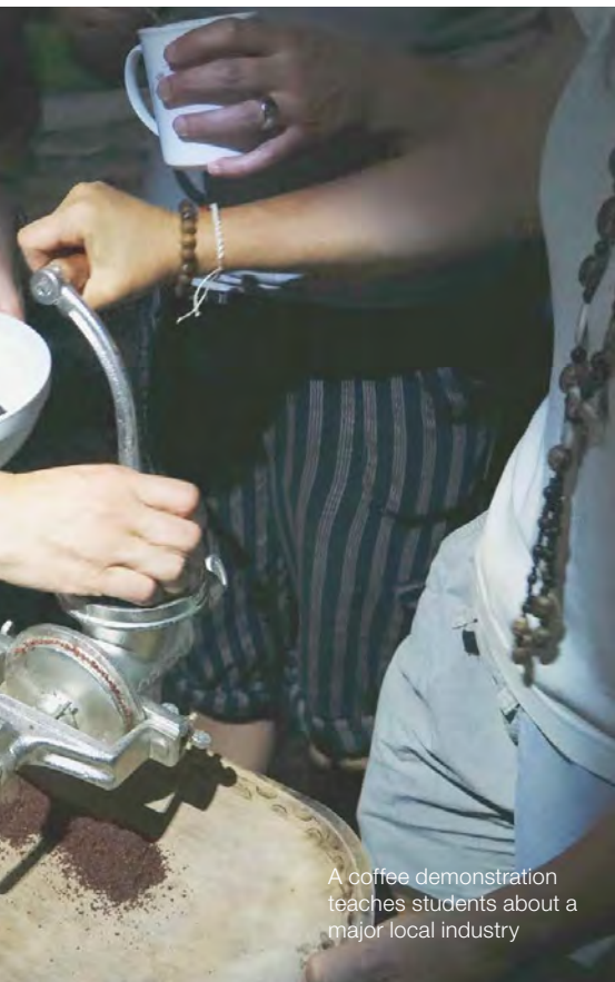
A coffee demonstration teaches students about a major local industry