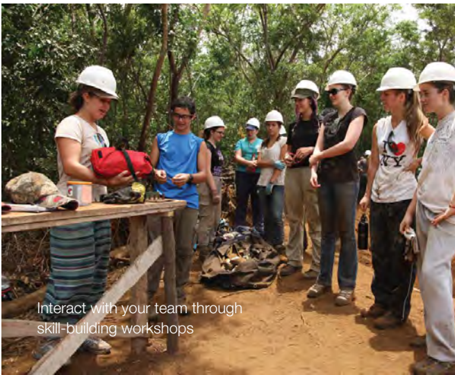
Interact with your team through skill-building workshops