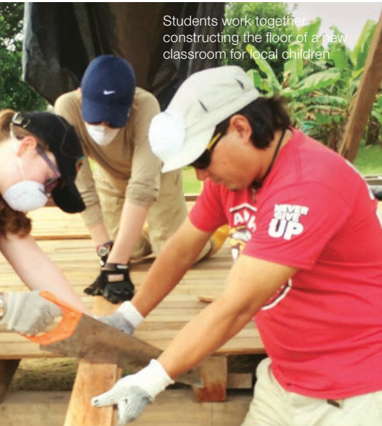
Students work together constructing the floor of a new classroom for local children