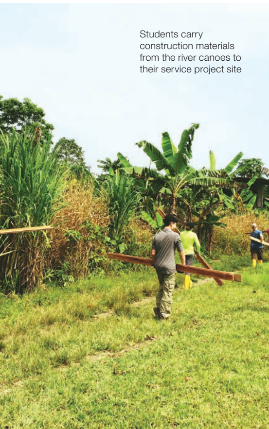
Students carry construction materials from the river canoes to their service project site