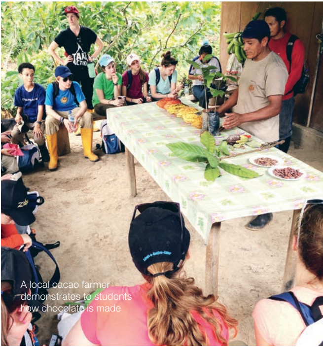
A local cacao farmer demonstrates to students how chocolate is made