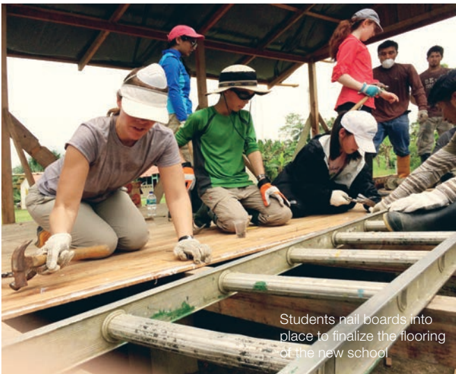
Students nail boards into place to finalize the flooring of the new school