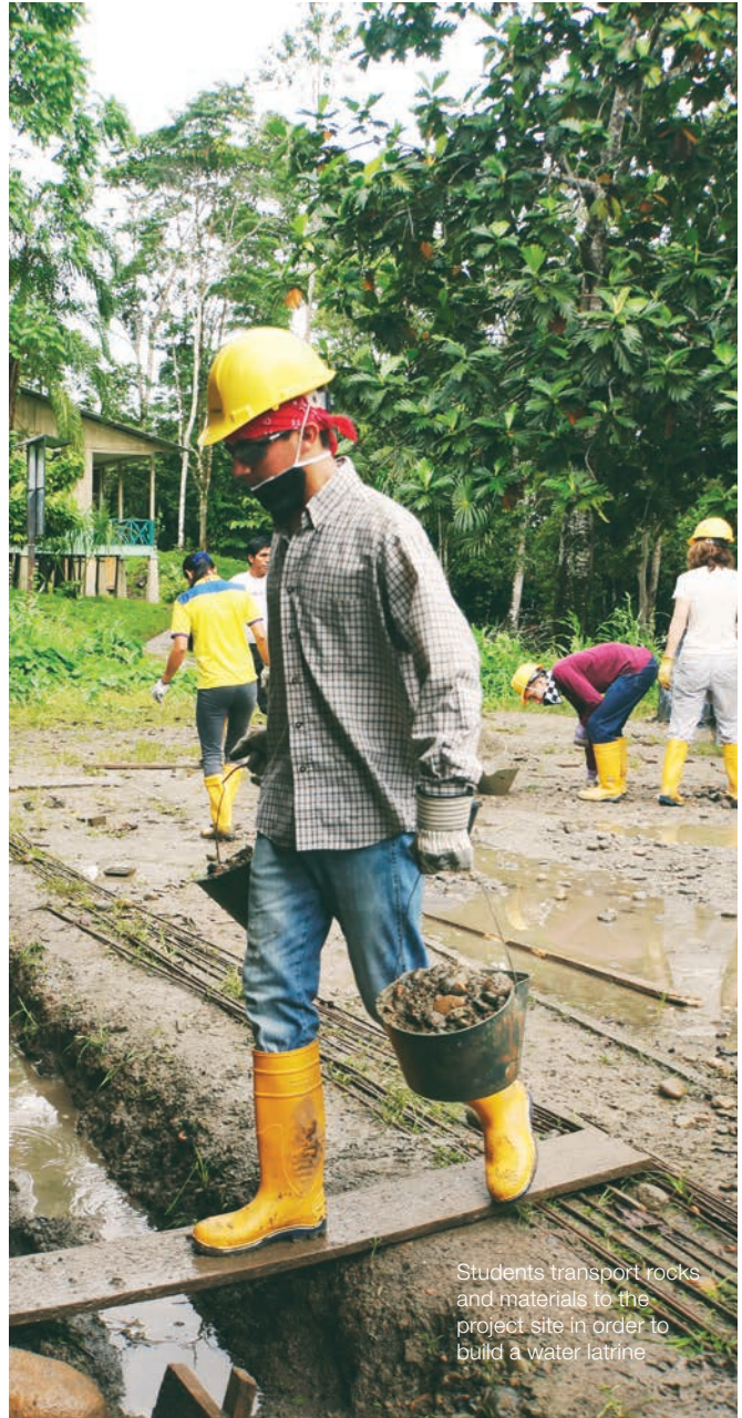
Students transport rocks and materials to the project site in order to build a water latrine