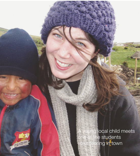
A young local child meets one of the students volunteering in town