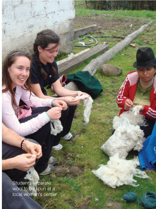
Students separate wool to be spun at a local women's center