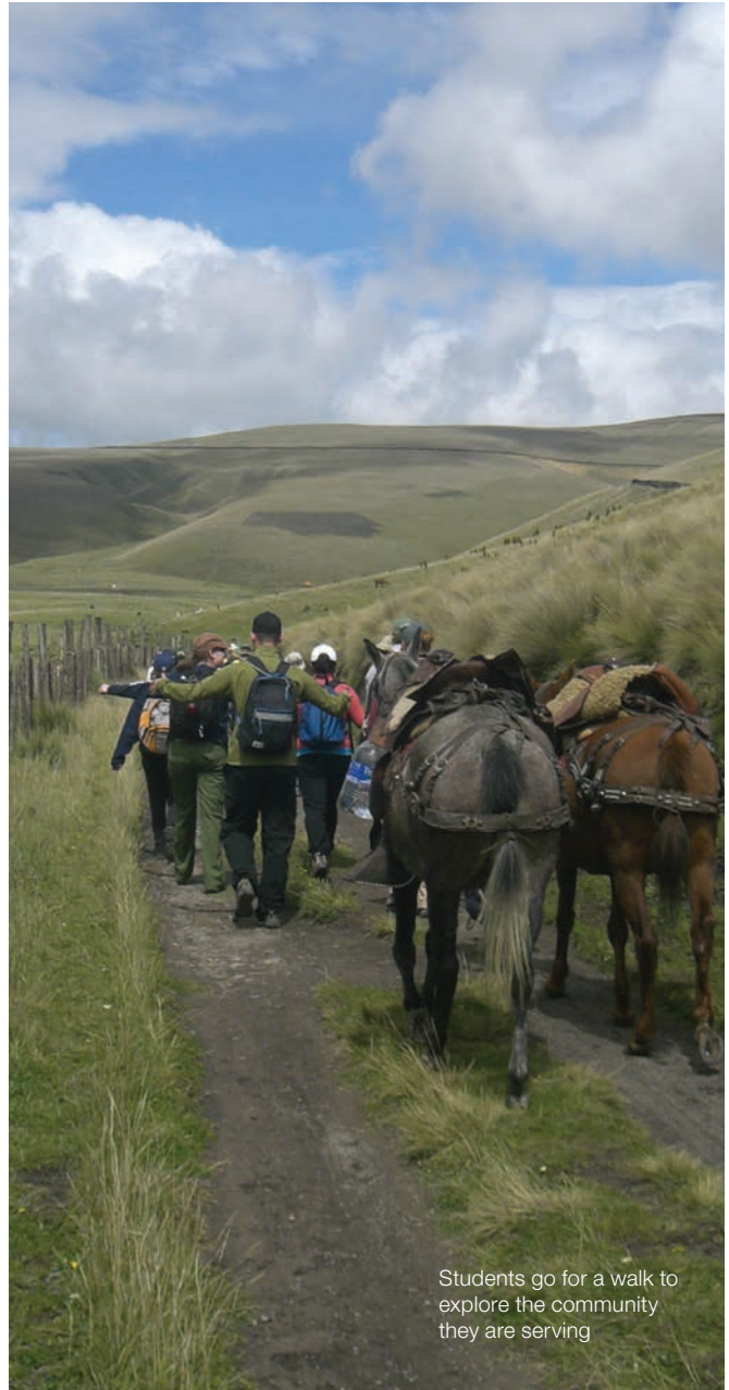
Students go for a walk to explore the community they are serving