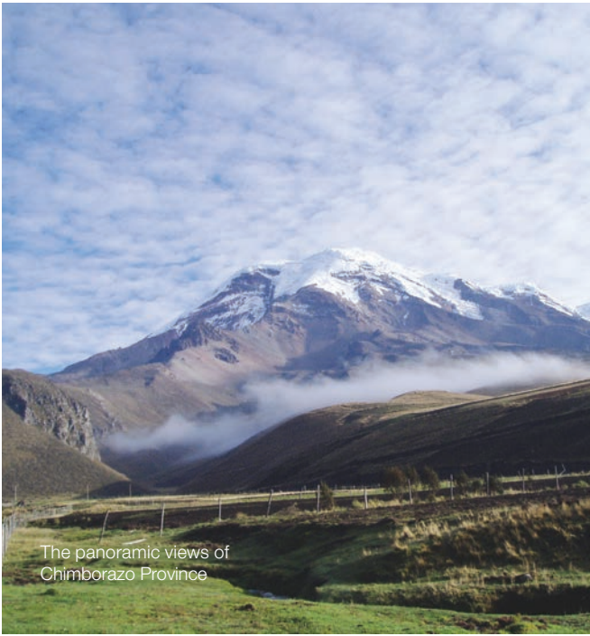
The panoramic views of Chimborazo Province