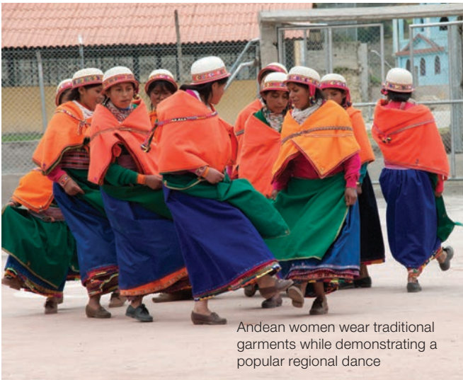
Andean women wear traditional garments while demonstrating a popular regional dance