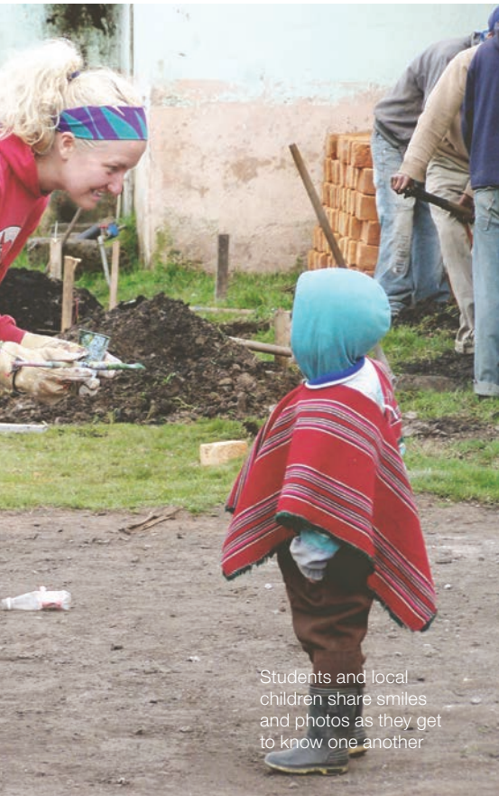
Students and local children share smiles and photos as they get to know one another