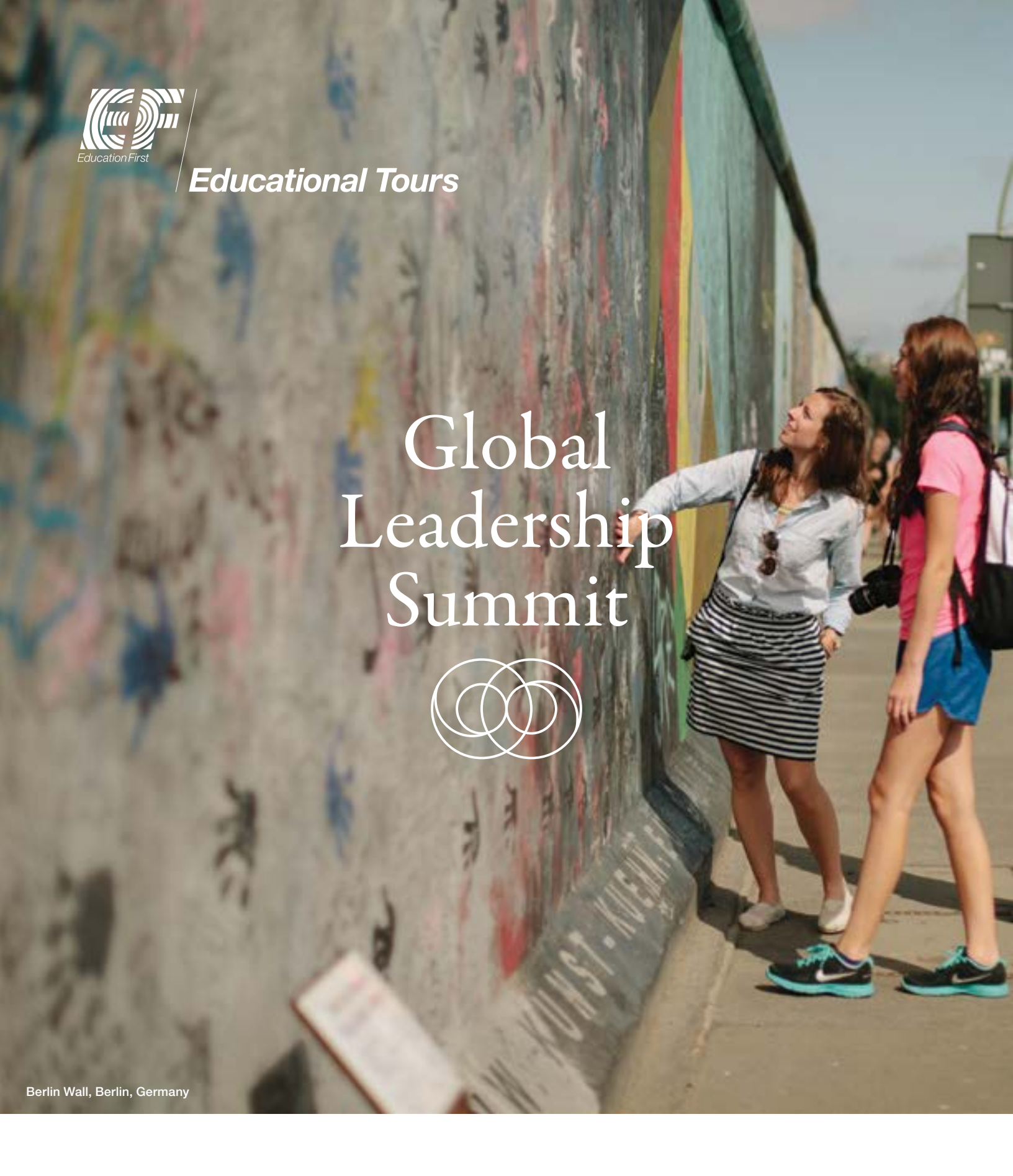
The Influence of Technology on Society