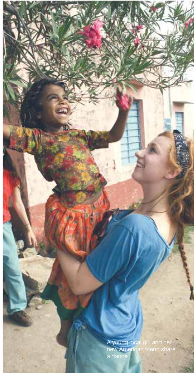
A young local girl and her new American friend share a dance