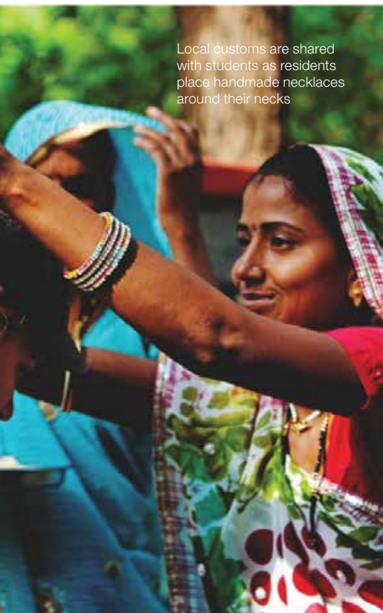
Local customs are shared with students as residents place handmade necklaces around their necks