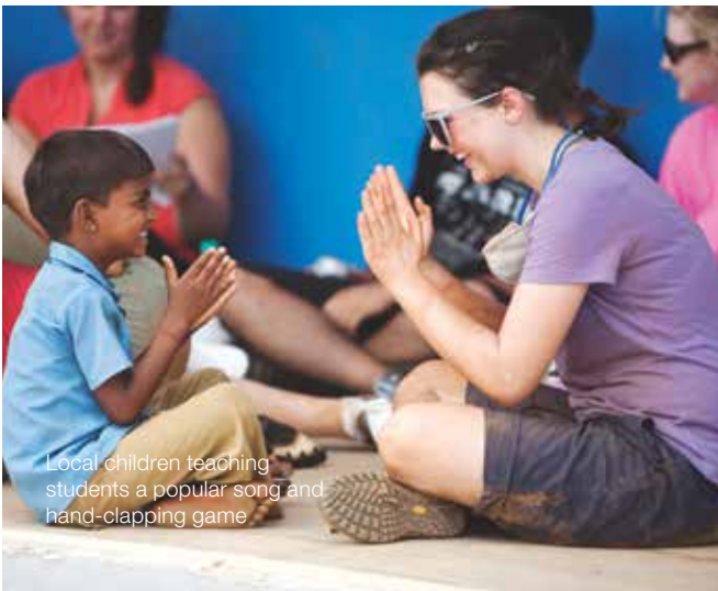
Local children teaching students a popular song and hand-clapping game