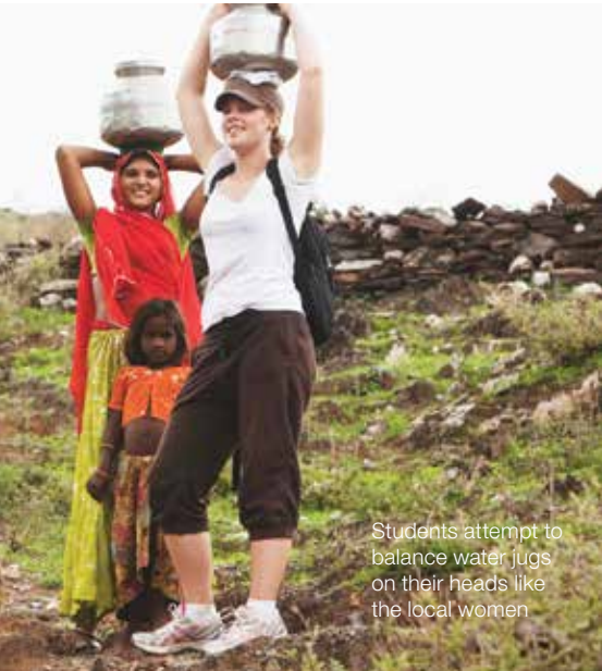
Students attempt to balance water jugs on their heads like the local women