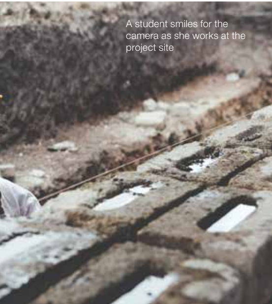
A student smiles for the camera as she works at the project site