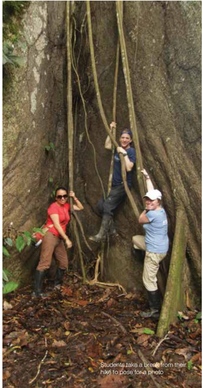
Students take a break from their hike to pose for a photo