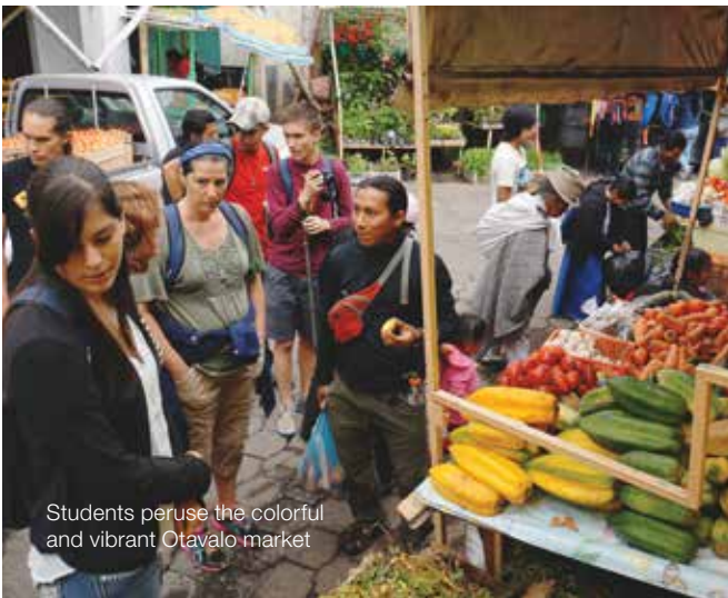
Students peruse the colorful and vibrant Otavalo market