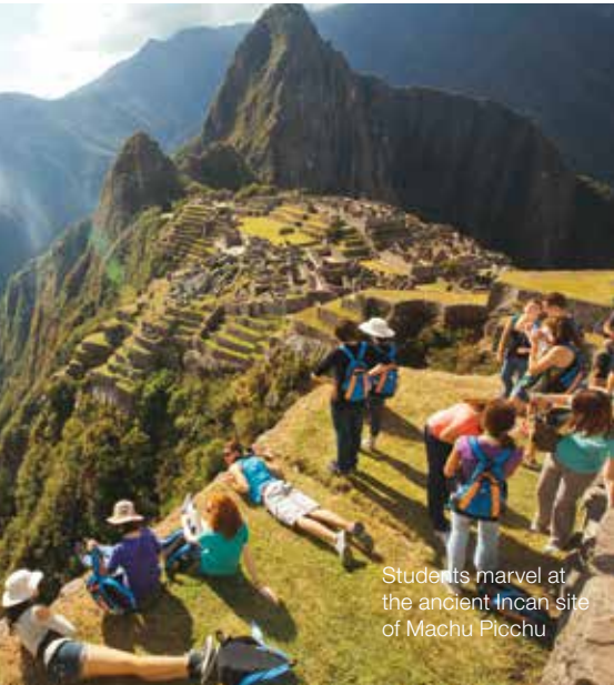
Students marvel at the ancient Incan site of Machu Picchu