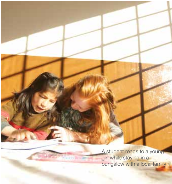
A student reads to a young girl while staying in a bungalow with a local family