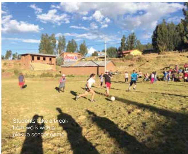
Students take a break from work with a pickup soccer game