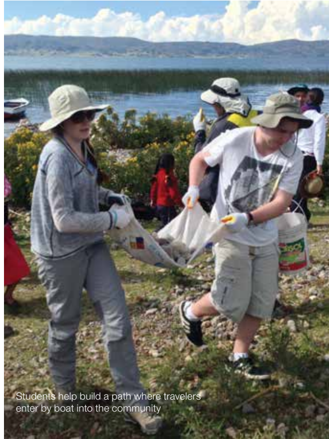
Students help build a path where travelers enter by boat into the community