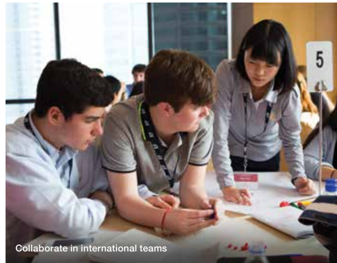
Collaborate in international teams

weShare, our online learning platform, gives you a place to research, reflect and share a project pre and post tour.