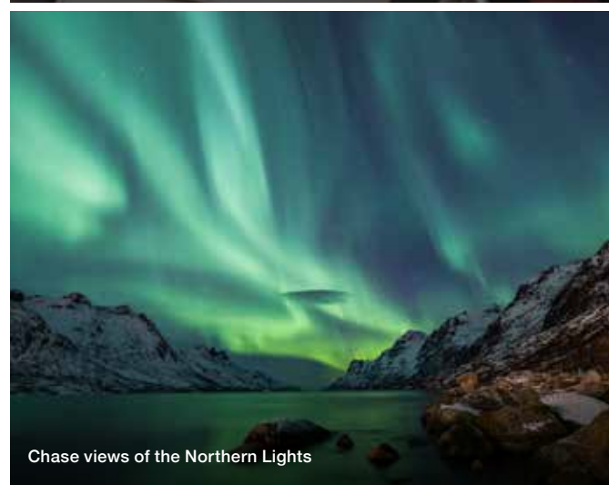
Chase views of the Northern Lights