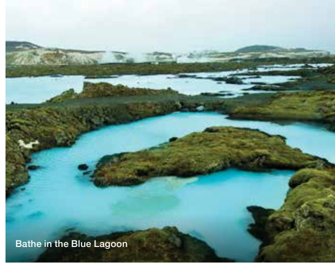
Bathe in the Blue Lagoon

That makes Iceland the perfect stage for our 2016 Global Student Leaders Summit, The Future of Energy. This extraordinary event combines an educational tour and two-day leadership conference, exploring renewable energy where it comes to life. You will learn from world-renowned experts on science and energy, and work together with peers from the United States and Iceland to design and present your own solution to the issue.