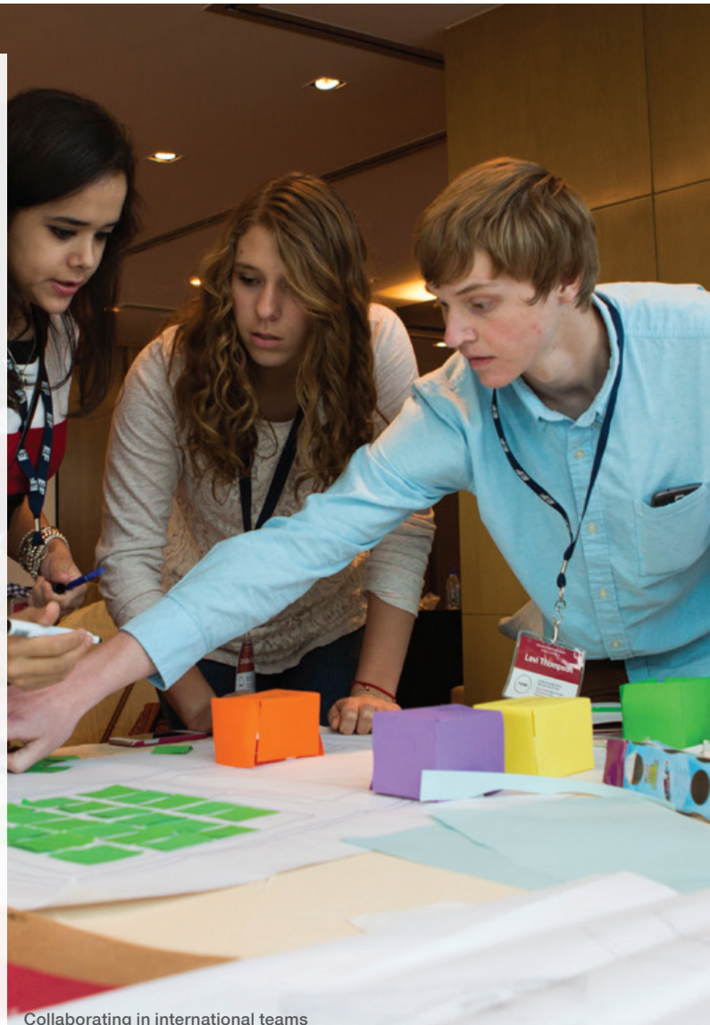
Collaborating in international teams

EF's online platform for a deeper learning experience both pre- and post-tour