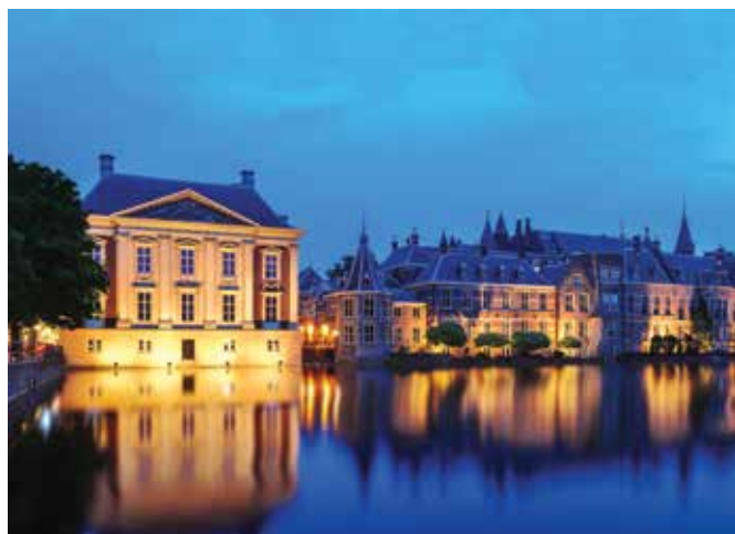
Dutch Parliament buildings in The Hague