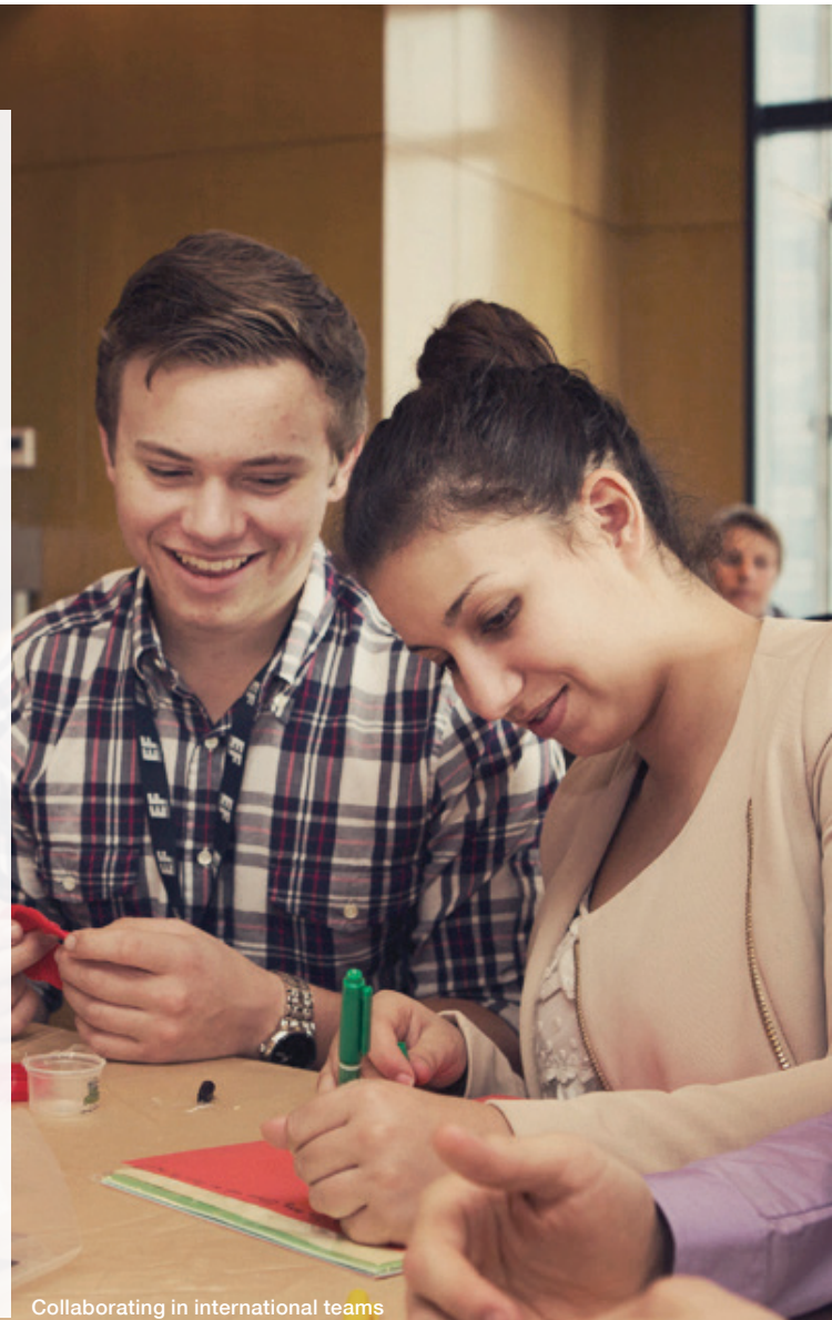
Collaborating in international teams

Our online platform for a deeper learning experience both pre- and post-tour