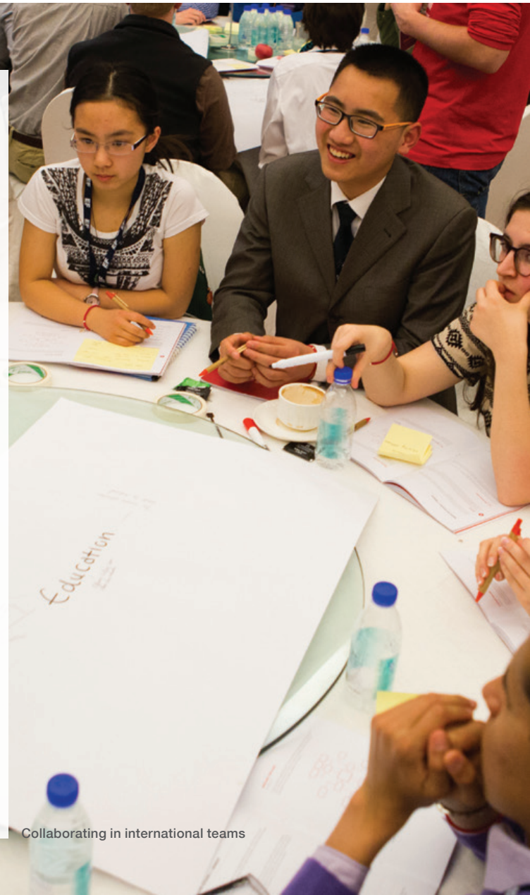
Collaborating in international teams

EF's online platform for a deeper learning experience both pre- and post-tour