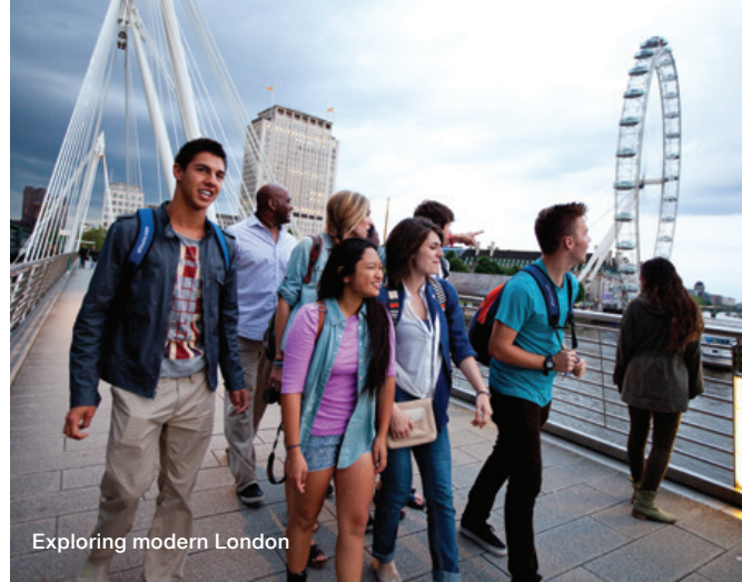
Exploring modern London

weShare, our online learning platform, gives you a place to research, reflect and share how you plan to impact local change as part of your final project. You can even earn high school credit.