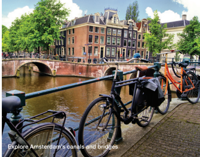
Explore Amsterdam's canals and bridges

weShare, our online learning platform, gives you a place to research, reflect and share how you plan to impact local change as part of your final project. You can even earn high school credit.