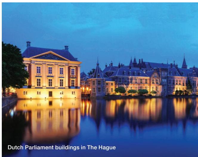
Dutch Parliament buildings in The Hague