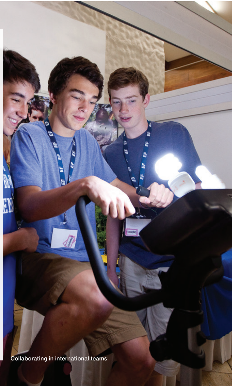
Collaborating in international teams

EF's online platform for a deeper learning experience both pre- and post-tour.