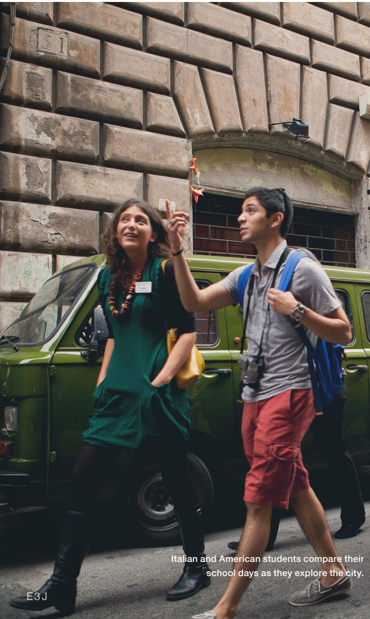
Italian and American students compare their school days as they explore the city.

We believe in experiential learning at the most important sites. Your Tour Director is with you at every step, providing their own perspective and local tips.