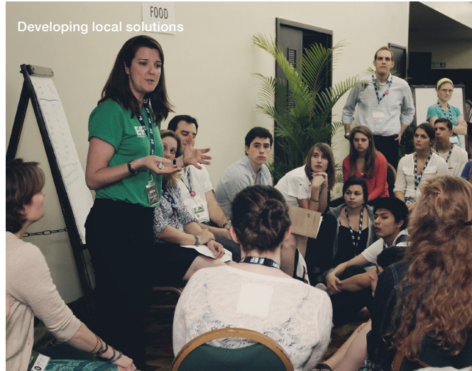
FOOD Developing local solutions