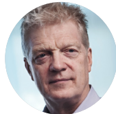
SIR KEN ROBINSON

In Davos you will hear from world-renowned experts and speakers, including keynote Sir Ken Robinson , an internationally recognized leader in the development of education, creativity and innovation. With one of the most viewed TED Talks of all time, his speech will challenge you to examine the ways technology and globalization are impacting schools throughout the world. Then, using the design thinking process, you'll collaborate with peers in small international teams to develop local solutions. The conference culminates with the Innovation Village, a showcase of student work where your ideas are shared and celebrated.