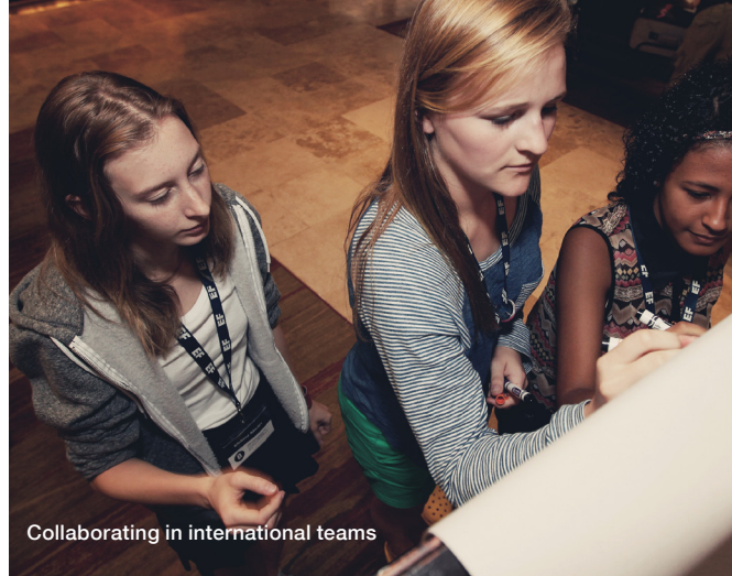
Collaborating in international teams

When you return home, the learning experience continues online with weShare, where you can reflect on what you learned globally and use it to impact change locally. You can even submit your project for high school and college credit.