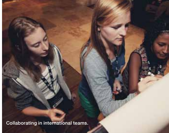
Collaborating in international teams.

Back home, the learning experience continues with weShare, where you can submit and share your final project online for high school or college credit. The best project even receives grant money to help make it a reality.