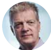
SIR KEN ROBINSON

In Davos you will hear from world-renowned experts and speakers, including keynote Sir Ken Robinson , an internationally recognized leader in the development of education, creativity and innovation. With one of the most viewed TED Talks of all time, his speech will challenge you to examine the ways technology and globalization are impacting schools throughout the world. Then, using the design thinking process, you'll collaborate with peers in small international teams to develop local solutions. The conference culminates with the Innovation Village, a showcase of student work where your ideas are shared and celebrated.