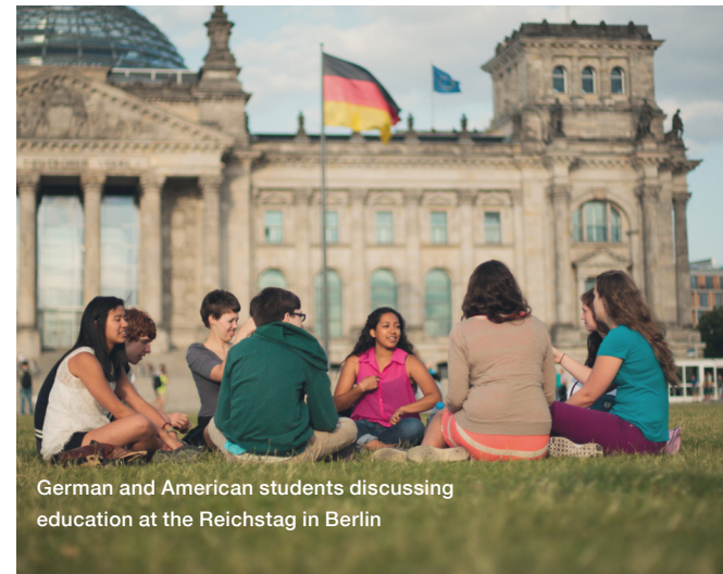
German and American students discussing education at the Reichstag in Berlin