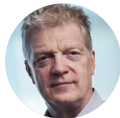
SIR KEN ROBINSON

In Davos you will hear from world-renowned experts and speakers, including keynote Sir Ken Robinson , an internationally recognized leader in the development of education, creativity and innovation. With one of the most viewed TED Talks of all time, his speech will challenge you to examine the ways technology and globalization are impacting schools throughout the world. Then, using the design thinking process, you'll collaborate with peers in small international teams to develop local solutions. The conference culminates with the Innovation Village, a showcase of student work where your ideas are shared and celebrated.