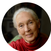
DR. JANE GOODALL