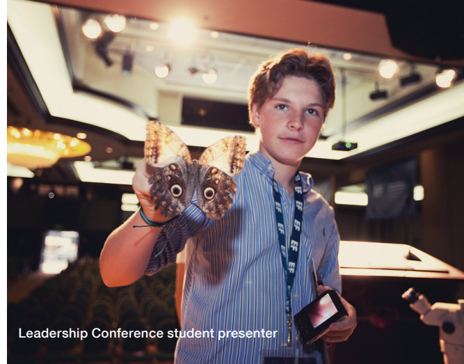
Leadership Conference student presenter

Back home, the learning experience continues with weShare, where you can submit and share your final project online for high school or college credit. The best project even receives grant money to help make it a reality.