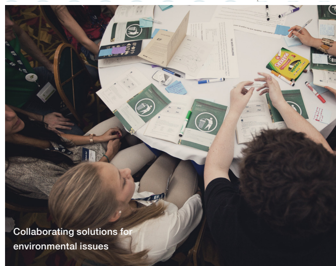
Collaborating solutions for environmental issues