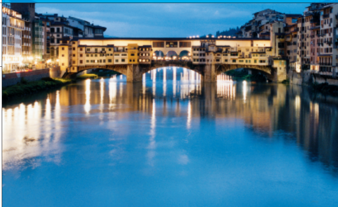
Florence rests along the Arno River and is the birthplace of the Italian Renaissance.

Experience the vast legacies of Venice, Florence and Rome. Study the architecture of Venice's picture-perfect palaces and imagine the centuries-old culture that is still visible in this water wonderland. Discover how Florence's Renaissance introduced the world to opera, artistic genius and Machiavellian politics. In the Eternal City, encounter the enduring influence of emperors and popes who shaped the course of world history.