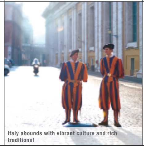
Italy abounds with vibrant culture and rich traditions!