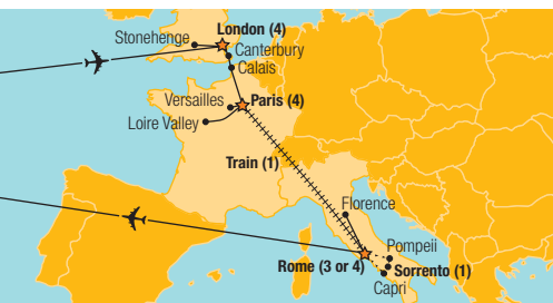
Number of overnight stays in parentheses. This tour may also be reversed.