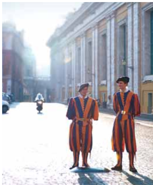
The Papal Swiss Guard has protected the Vatican for 500 years. I.M. Pei's pyramid, meanwhile, has stood at the entrance of the Louvre only since 1989.