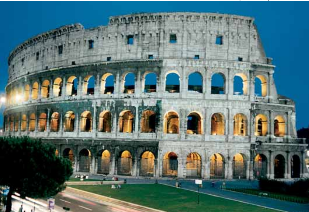
Rome's Colosseum has drawn sellout crowds since Titus opened the amphitheater in A.D. 80.

Tour director-led sightseeing of the Loire Valley • Journey through the French countryside to the magnificent Loire Valley, Playground of the Kings. Our first stop is Chartres, home to Europe's grandest Gothic (13th-century) cathe-