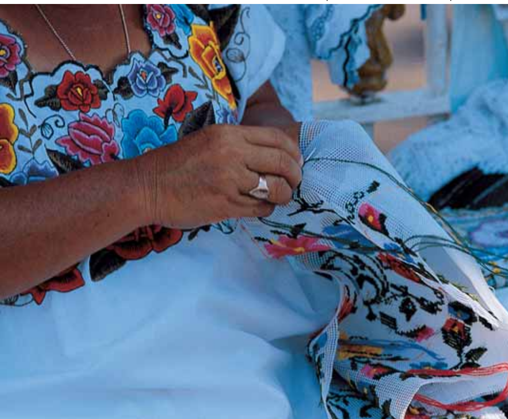
Mexican artisans are heirs to a rich tradition passed down from their Indian and Spanish ancestors.

Visit to Cenote X-Keken • You'll also stop at Cenote X-Keken, a natural well found deep inside a subterranean cave (rivers in the Yucatán flow underground).