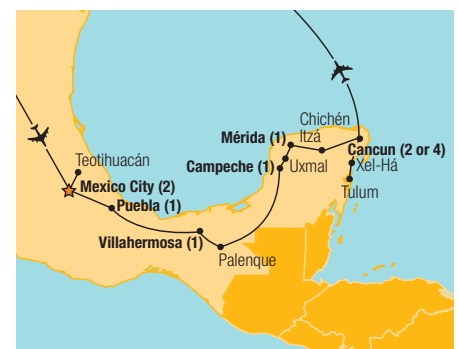
Number of overnight stays in parentheses.

Visit to the Templo Mayor Archaeological Site and Museum • Explore this fascinating museum which was founded in 1978, when a man accidentally dug up the Aztec stone of the moon goddess, Coyolxauhqui, while working on the adjacent Catedral Metropolitana. His discovery was followed by an even more impressive one: the interior remains of the Templo Mayor (the Great Temple), the most important structure for the Aztecs. In