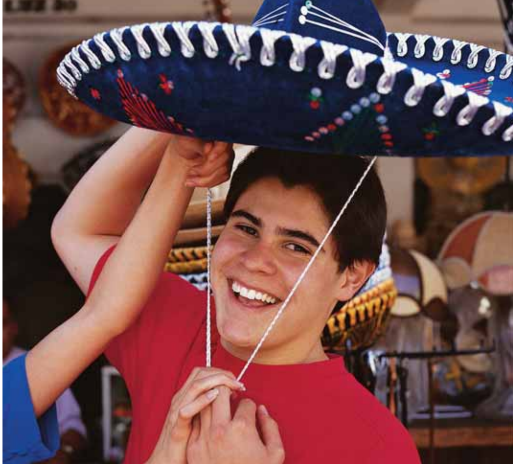
The wide Mexican hat called a sombrero gets its name from the Spanish sombre , meaning "shade."

Learn before you go www.ef-tours.com/pbsmexico