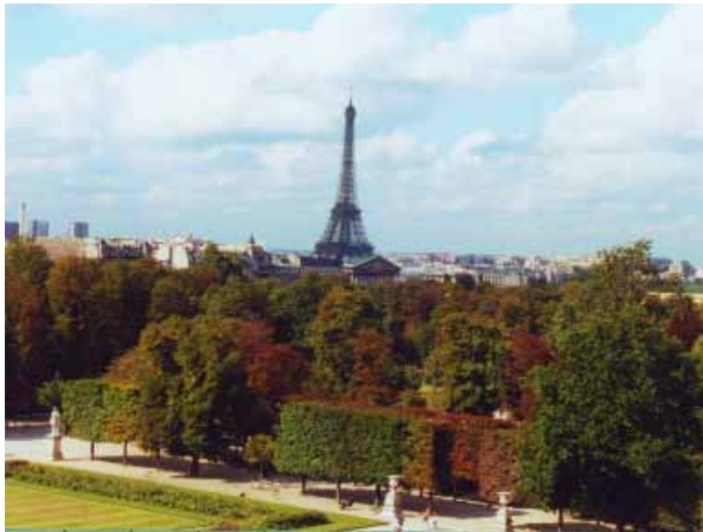
No matter where you are in the City of Light, the impressive Eiffel Tower seems to watch over you.

Learn before you go www.eftours.com/pbsfrance www.eftours.com/pbsspain