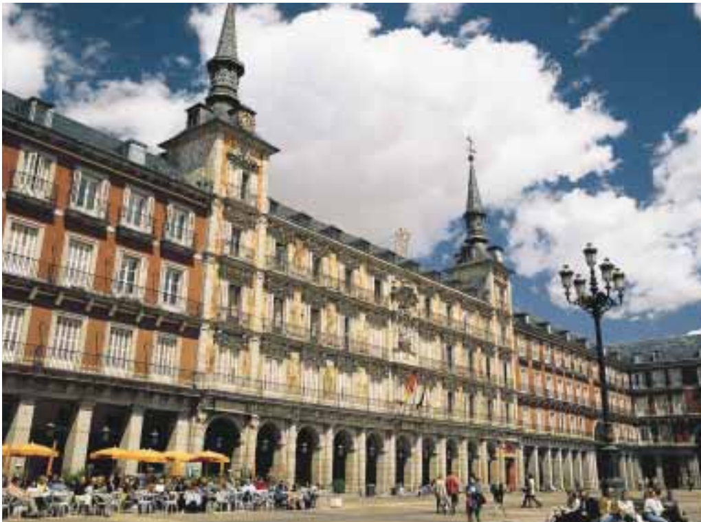
Plaza Mayor is an architectural showpiece and a popular gathering spot for Madrileños.

EF walking tour of Madrid • Meet at the Puerta del Sol for our EF walking tour of Madrid. Here Madrileños once battled Napoleon. Walk through