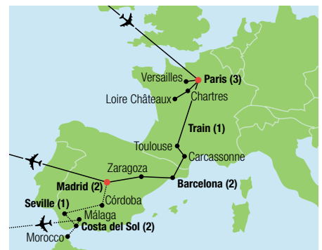
Number of overnight stays in parentheses.

Optional excursion to Versailles • Join an optional excursion to Versailles, the elaborate palace of Louis XIV. Here the Sun King held court in the most lavish style imaginable. At one point, 1,000 nobles were attended by 4,000 servants inside the palace, while 15,000 soldiers and servants inhabited the annexes. Stroll through the elegantly landscaped gardens, designed by André Le Nôtre, tour the State Apartments of the King himself, walk through the historic Hall of Mirrors and admire the ornate decor of the State Apartments of the Queen. (Please note: Because of the extreme popularity of Versailles, guided visits of the interior cannot be guaranteed during peak seasons. In this case, your group will hear a presentation from your guide before entering the palace). On occasions when Versailles is closed (as in every Monday) you'll instead take in the regal splendor of Château de Fontainebleau, a 12th-century royal residence that was a favored hunting palace for Napoleon and other rulers of France.